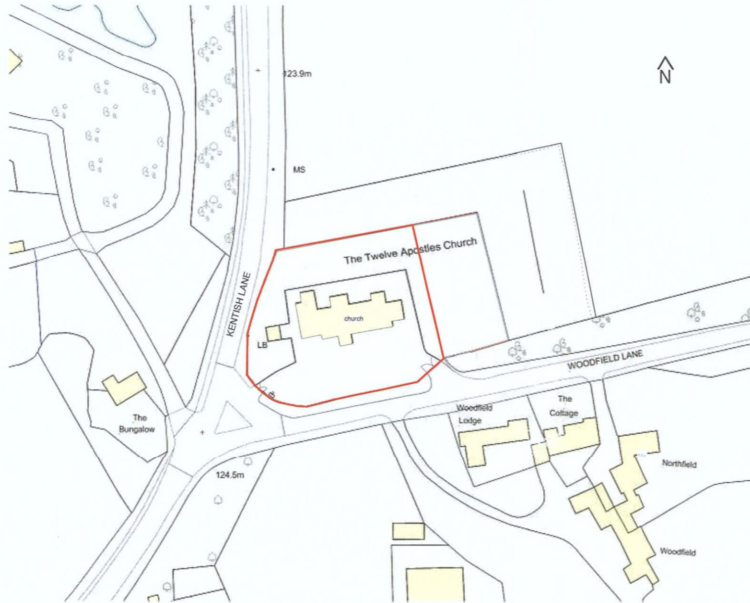
THE TWELVE APOSTLES CHURCH SITE MAP