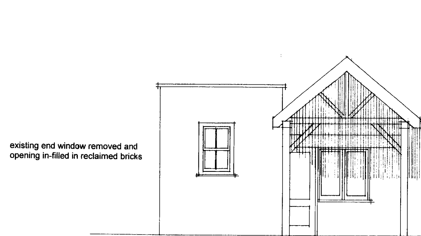
KITCHEN REAR ELEVATION