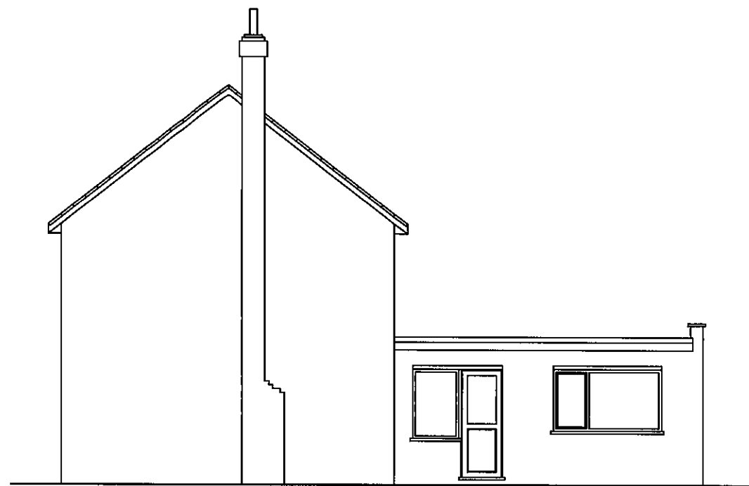
EXISTING FLANK ELEVATION