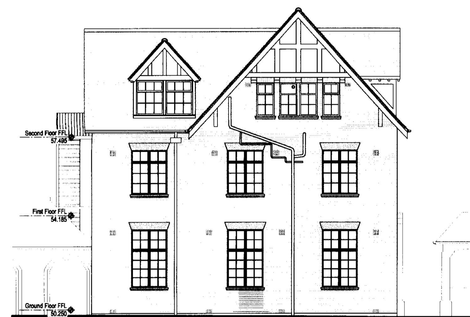
ELE 4 EXISTING SOUTH WEST FACING ELEVATION SCALE 1:100 @ A1