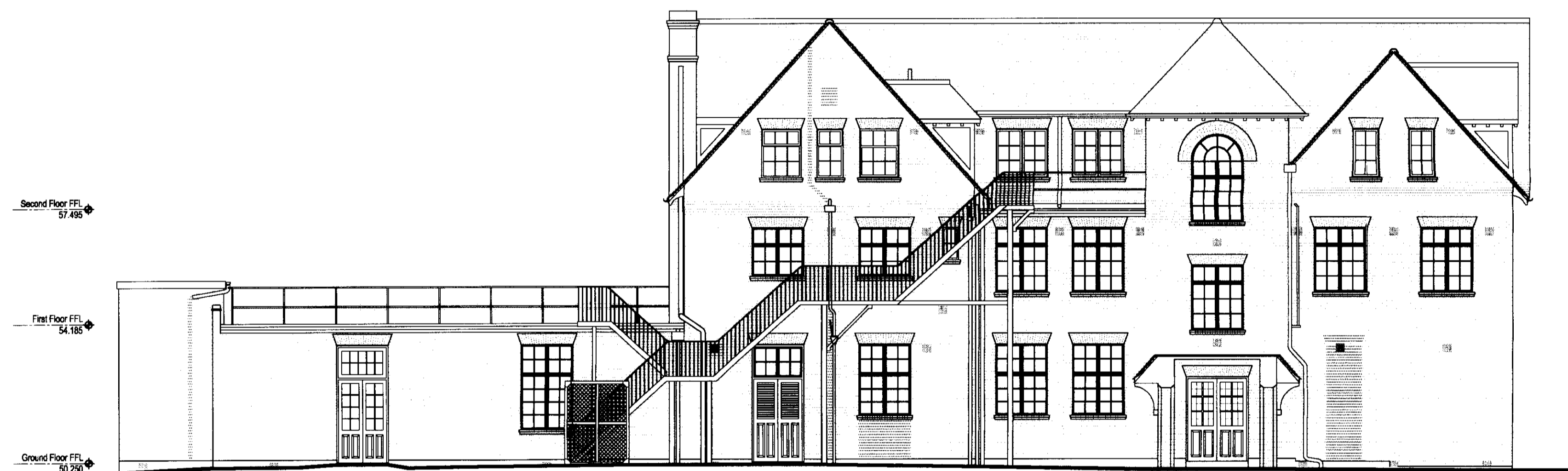
ELE 3 EXISTING NORTH WEST FACING ELEVATION SCALE 1:100 @ A1