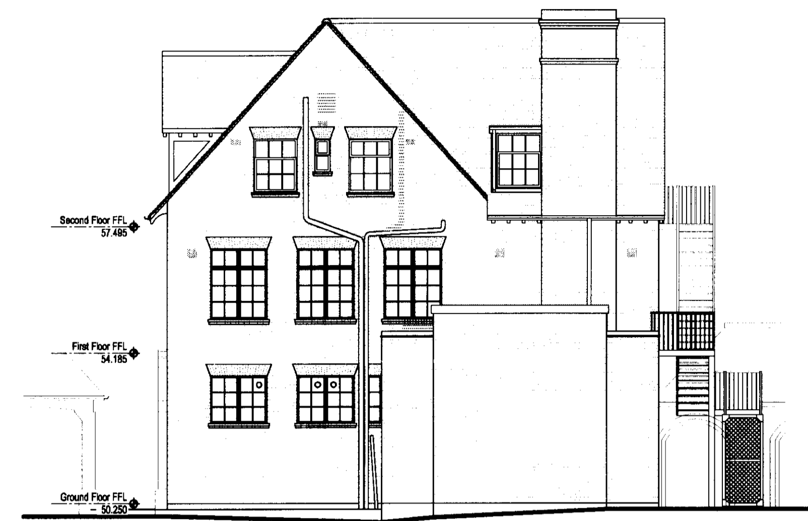
ELE 2 EXISTING NORTH EAST FACING ELEVATION SCALE 1:100 @ A1