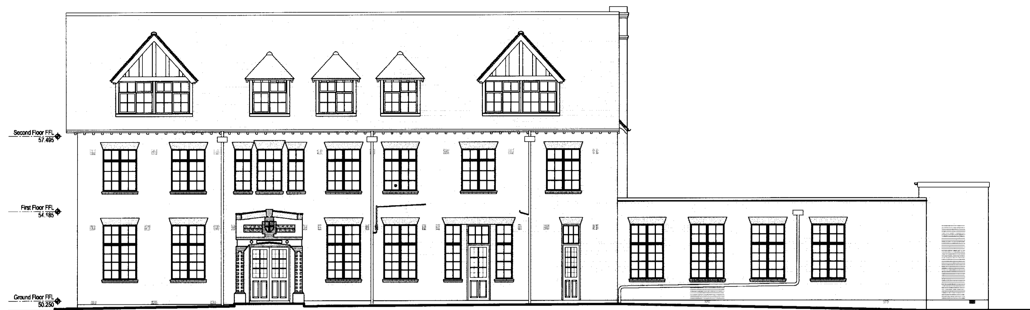
ELE 1 EXISTING SOUTH EAST FACING ELEVATION SCALE 1:100 @ A1