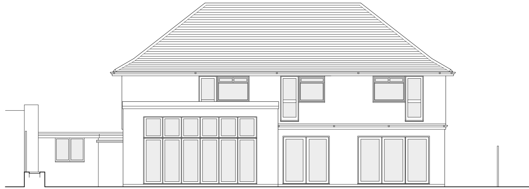
EXISTING REAR ELEVATION scale 1:100 @ A2