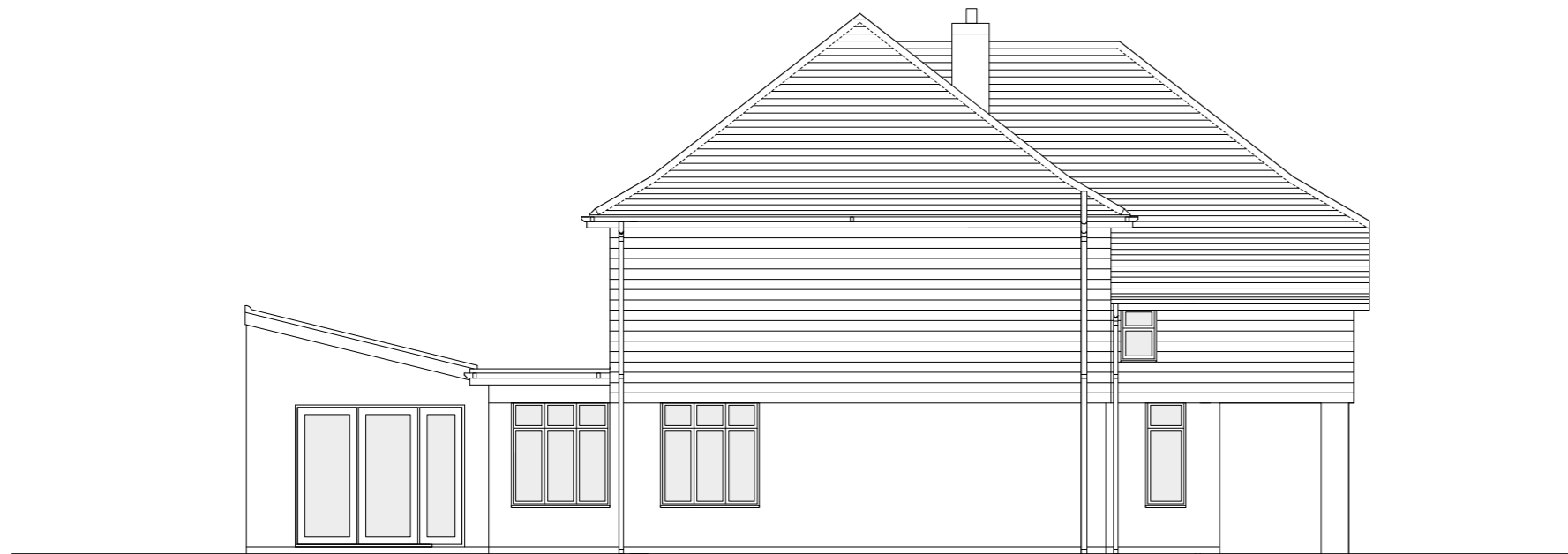
EXISTING SIDE (EAST) ELEVATION scale 1:100 @ A2