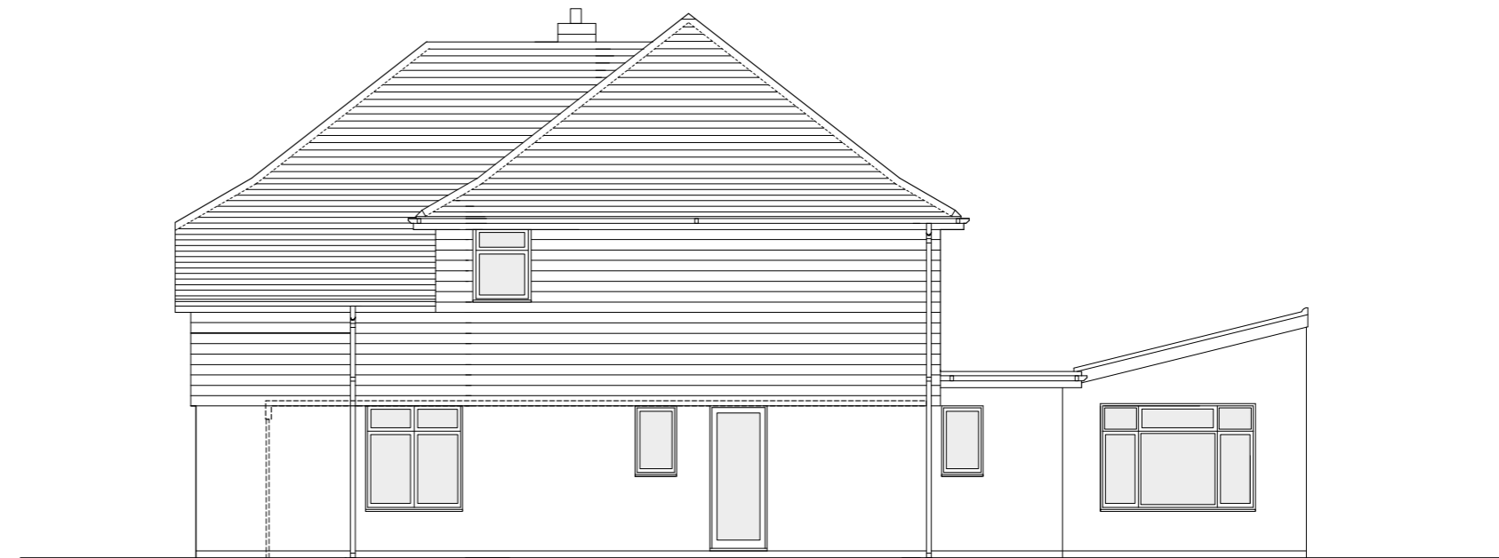
EXISTING SIDE (WEST) ELEVATION