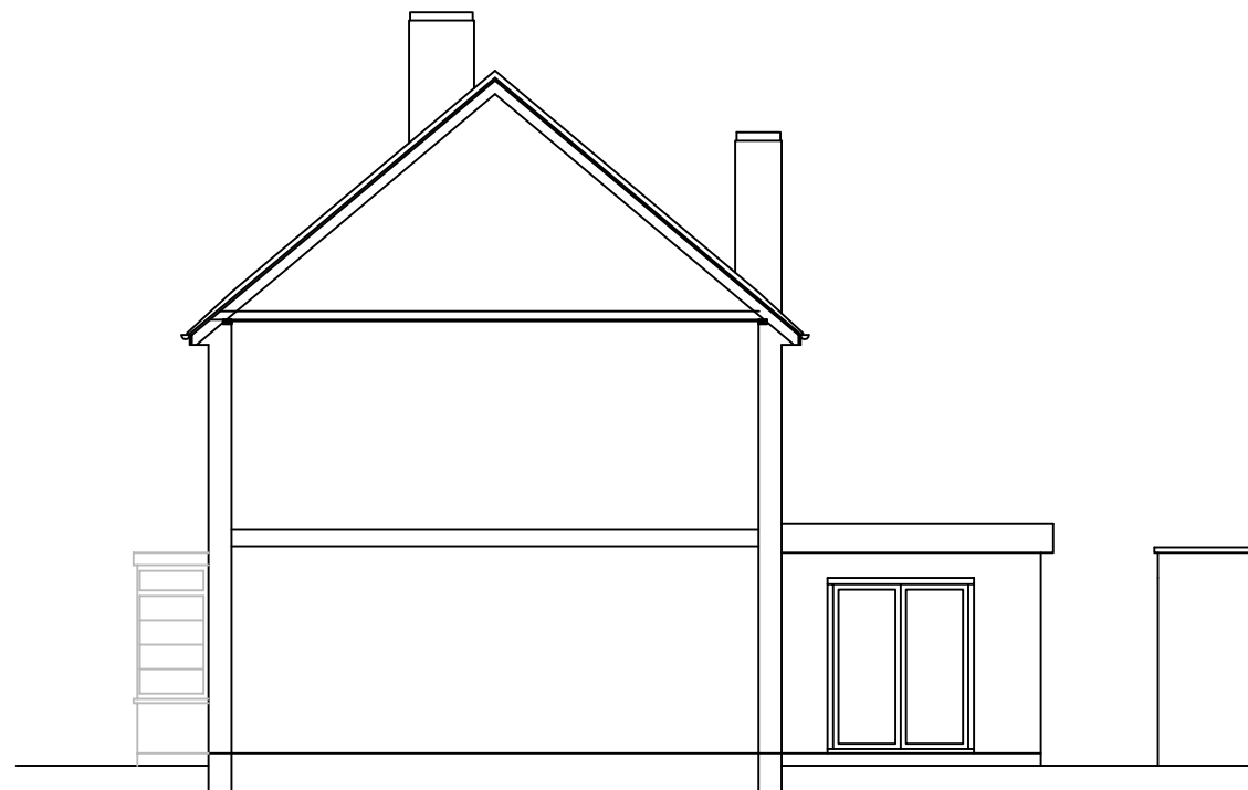
Existing Side Elevation (section through No6)