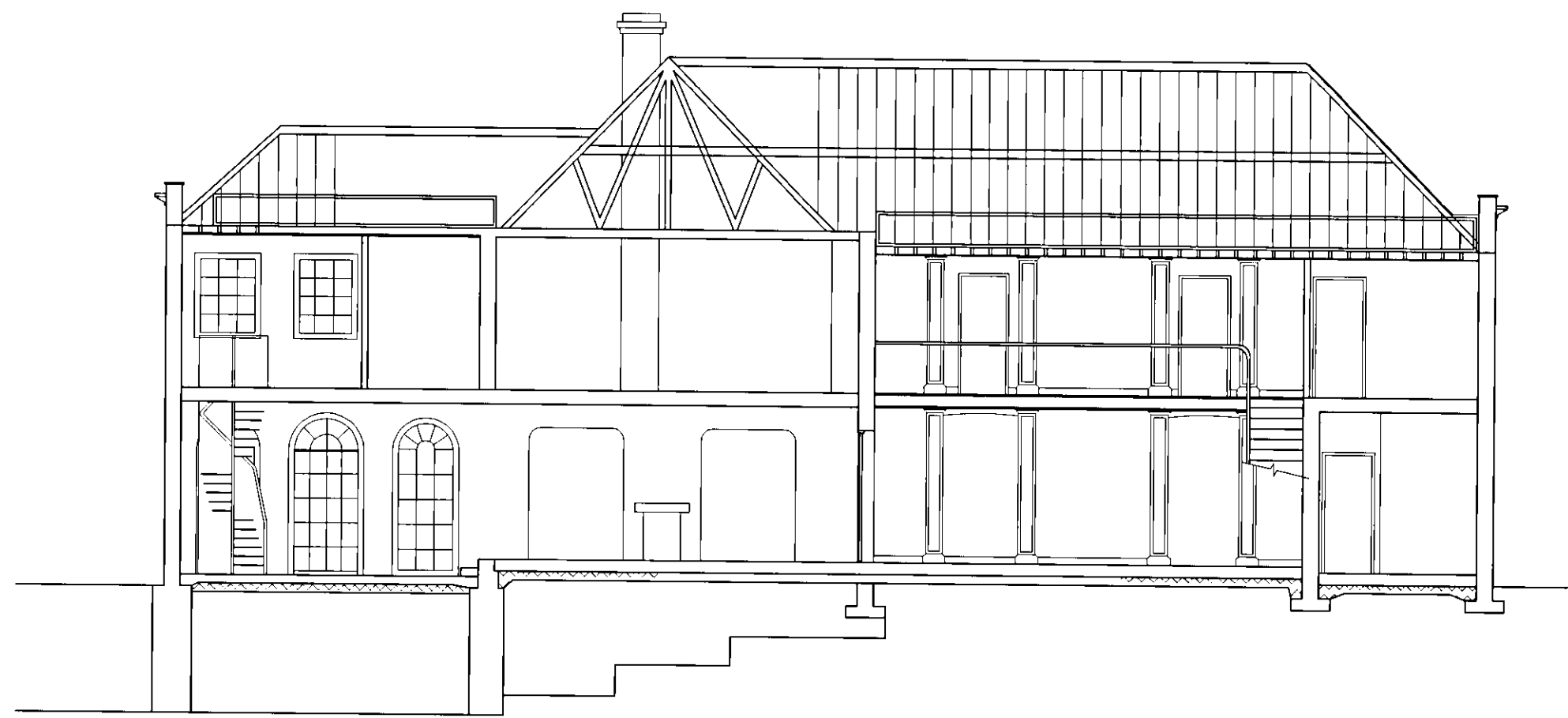
Existing Cross Section A-A