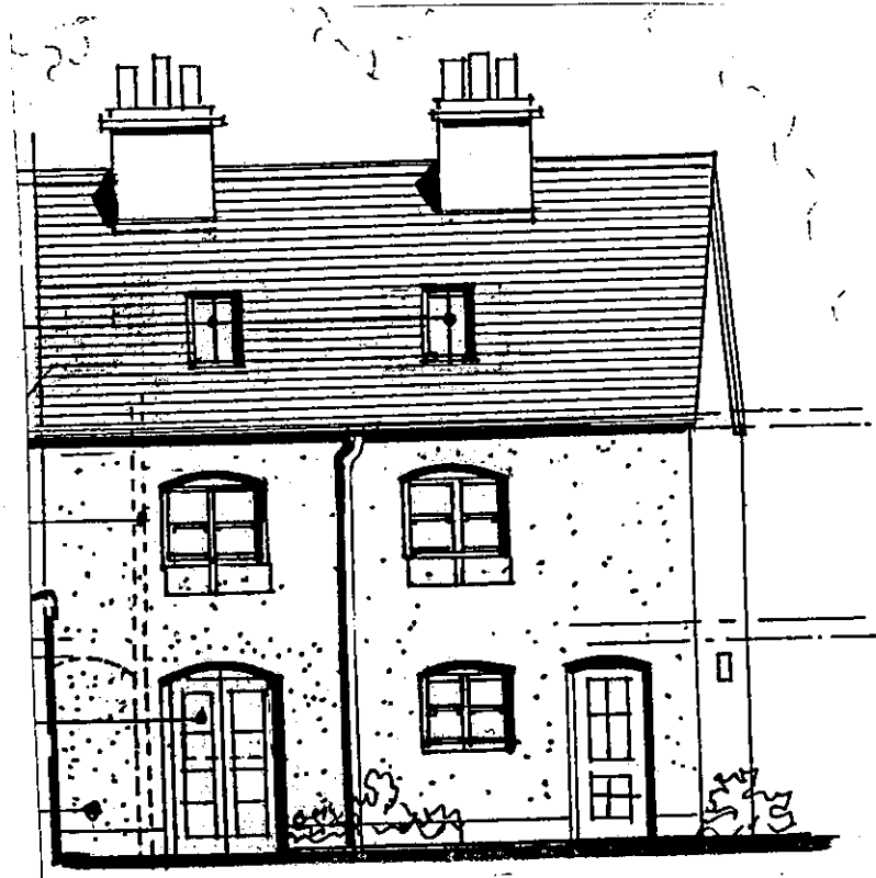
Current Rear Elevation

The width and top dimensions of the door and window would remain the same. The window would increase in height by 18 cms. The new window would be the same height.