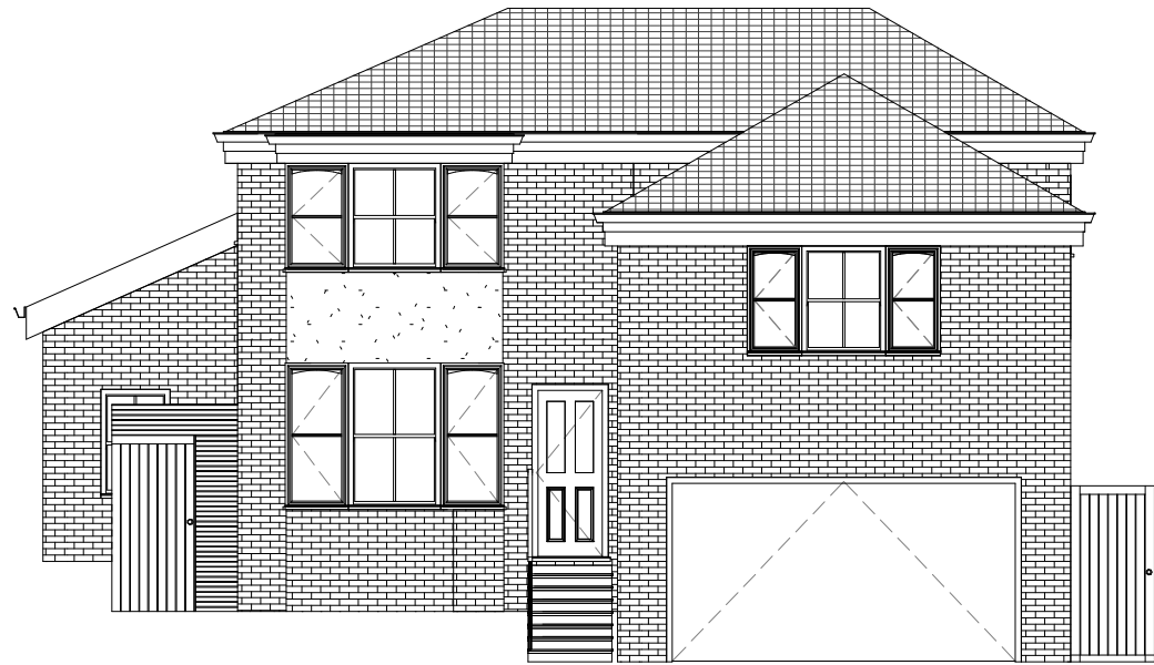
EXISTING FRONT ELEVATION 1 : 100