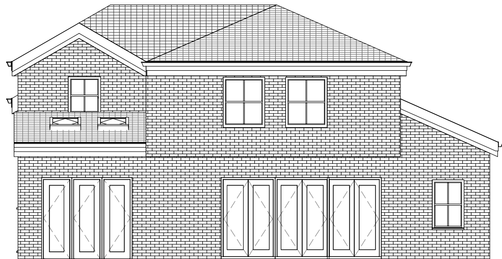
EXISTING REAR ELEVATION 1 : 100