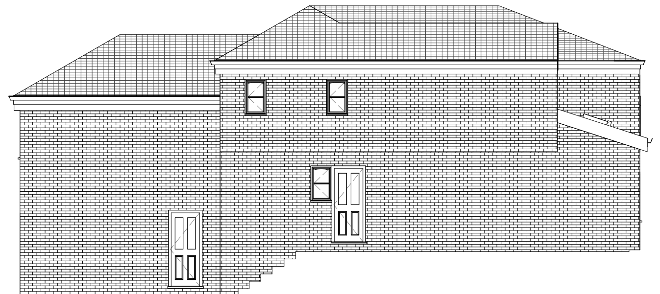
EXISTING SOUTH ELEVATION 1 : 100