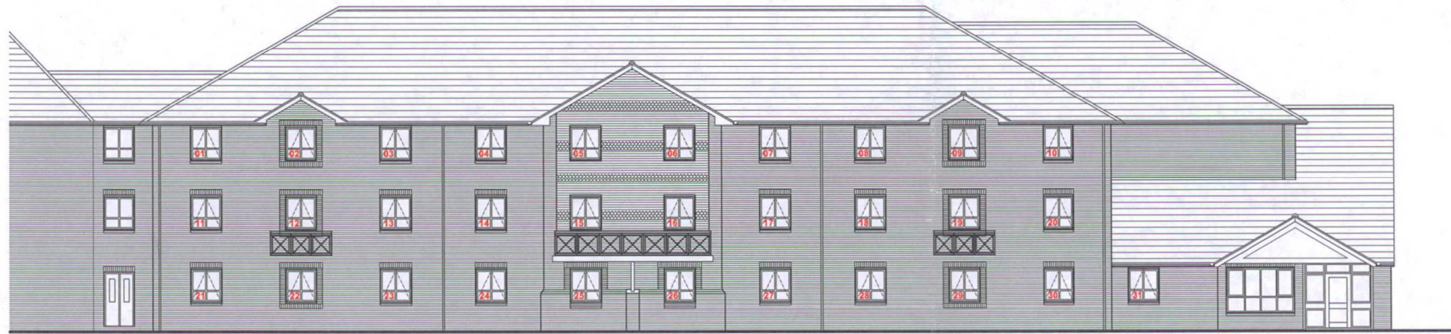
NEW BUILD → NORTH-EAST ELEVATION