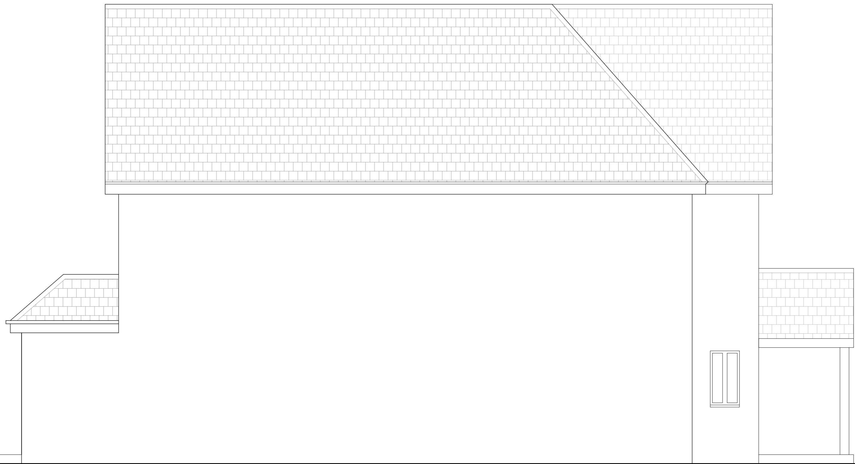
EXISTING SOUTH EAST ELEVATION 1:50