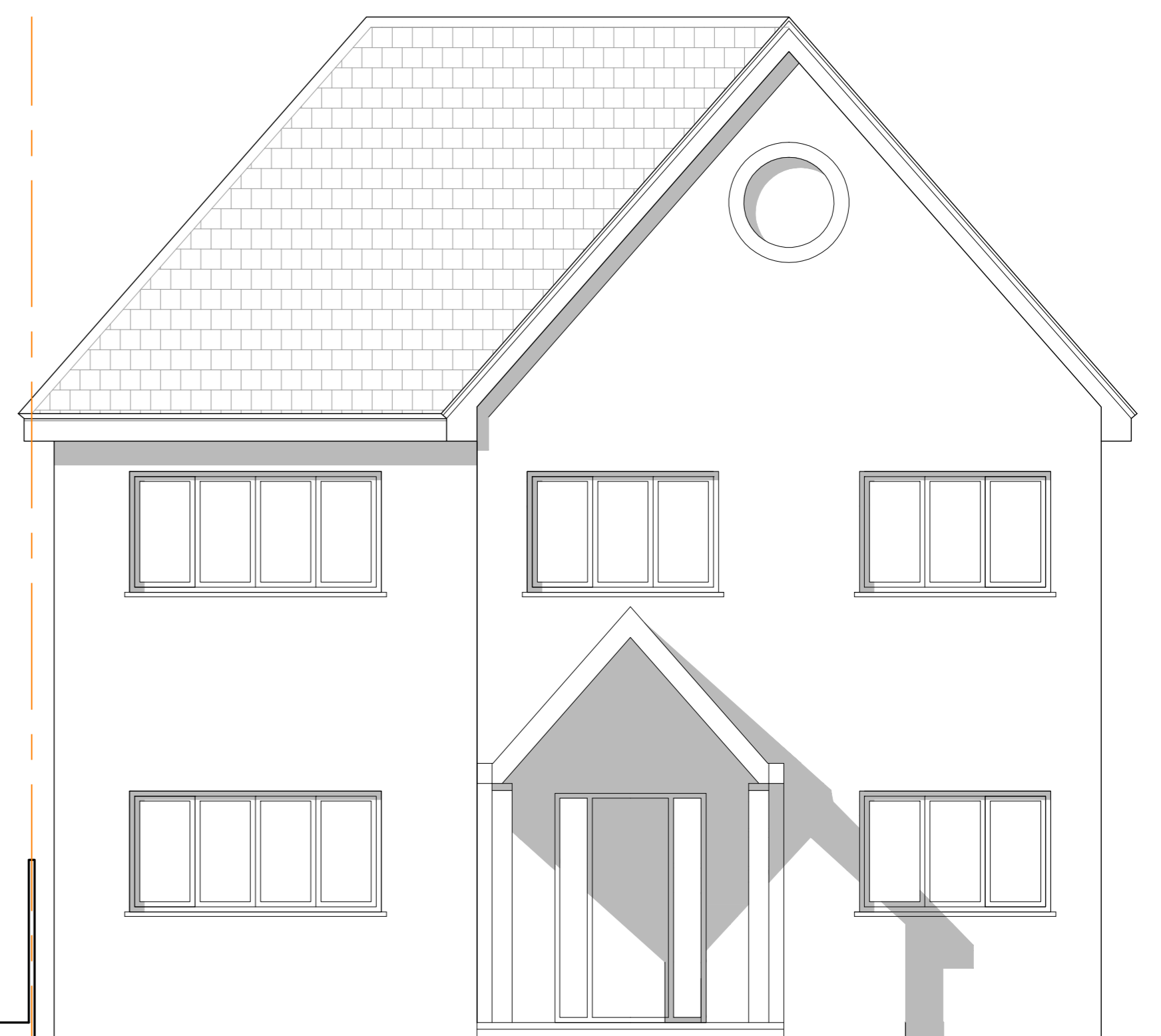
EXISTING NORTH EAST ELEVATION 1:50