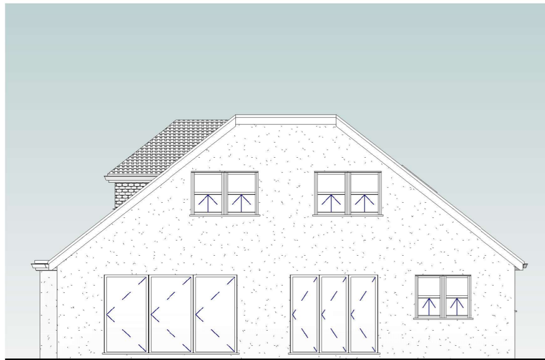
E3 Existing Rear 1 : 100