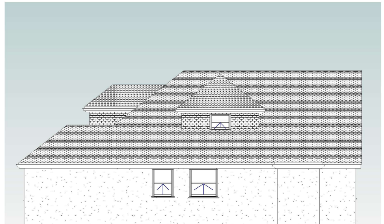
E4 Existing RHS 1 : 100