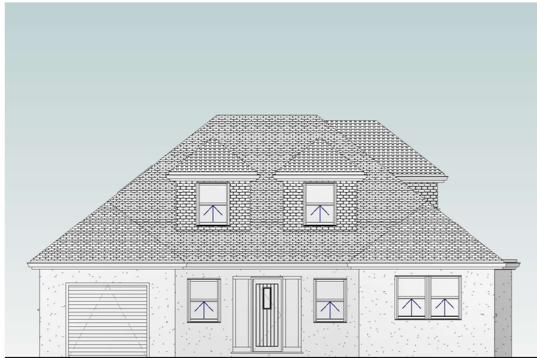
E1 Existing Front 1 : 100