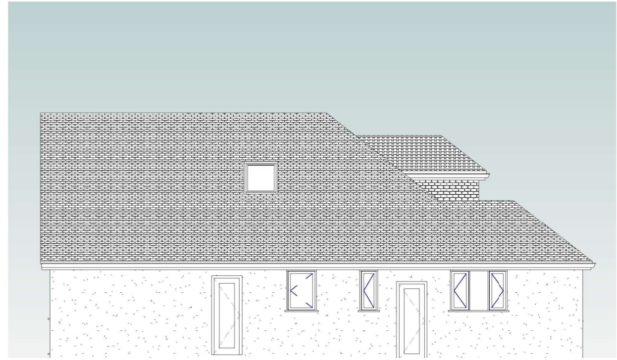
E2 Existing LHS 1 : 100