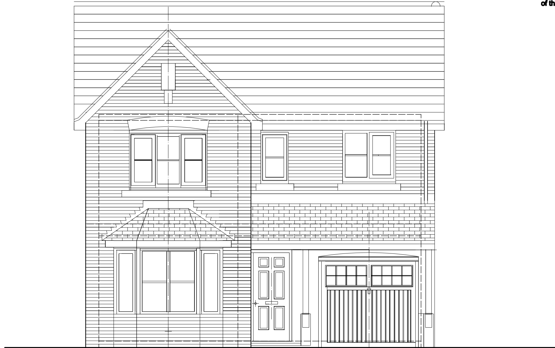
56 Bluebell Way

Householder Application for Planning Permission for works or extension to a dwelling. Town and Country Planning Act 1990 This drawing for planing application only This drawing is © P.J.Stasch Architect 2016 Copyright Plans, drawings and material submitted to the council are protected by the Copyright Acts (Section 47, 1988 Act). You may only use material which is downloaded or printed for consultation purposes. Further copies must not be made without prior permission of the copyright owner.