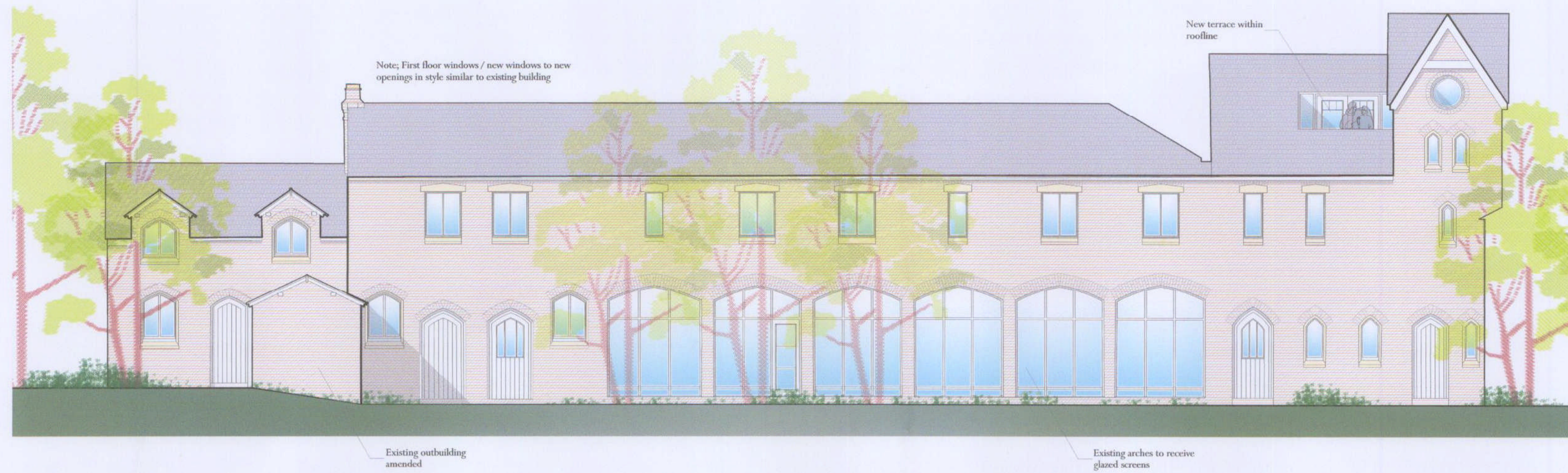
WEST ELEVATION F