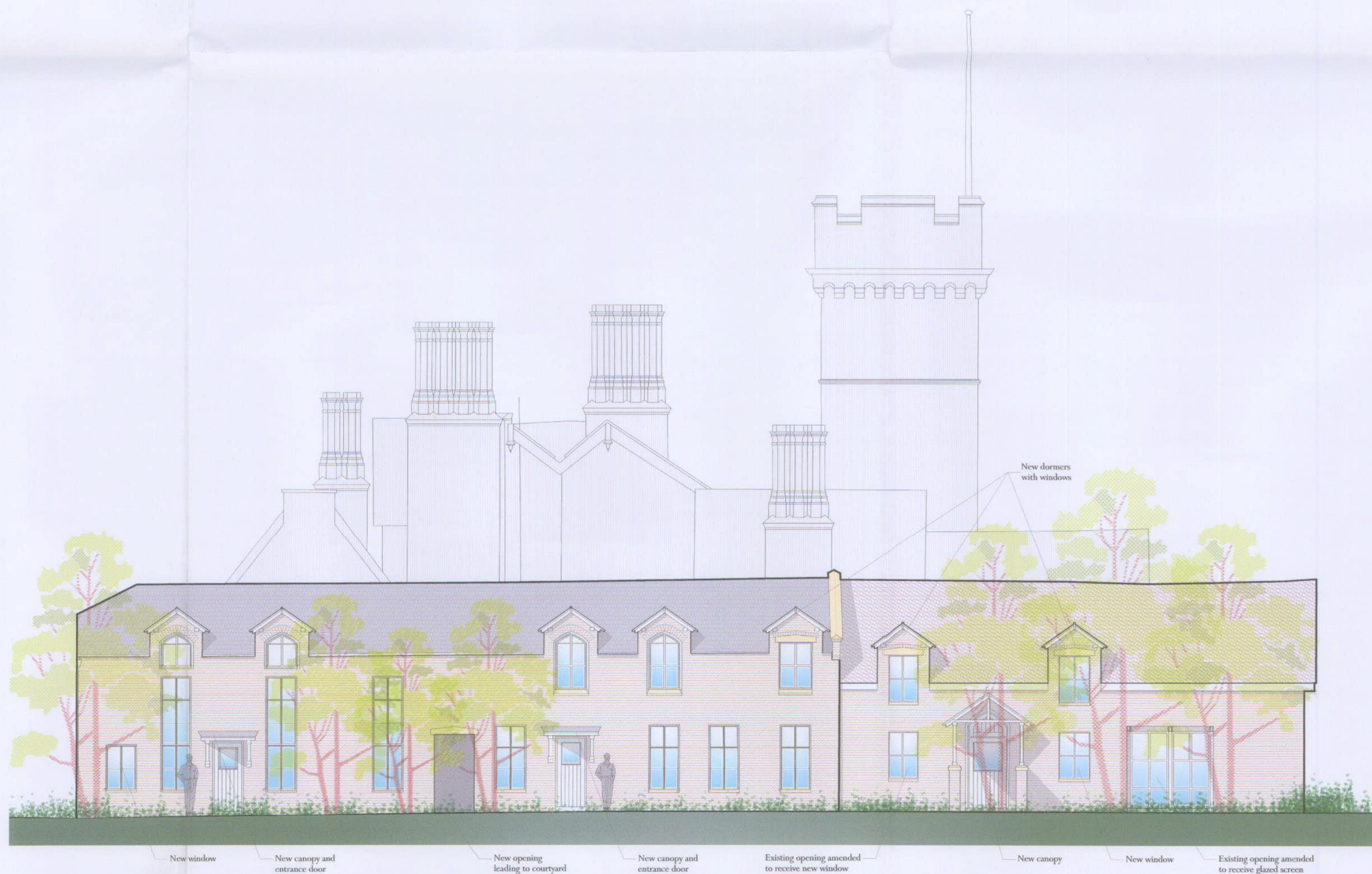
NORTH ELEVATION E