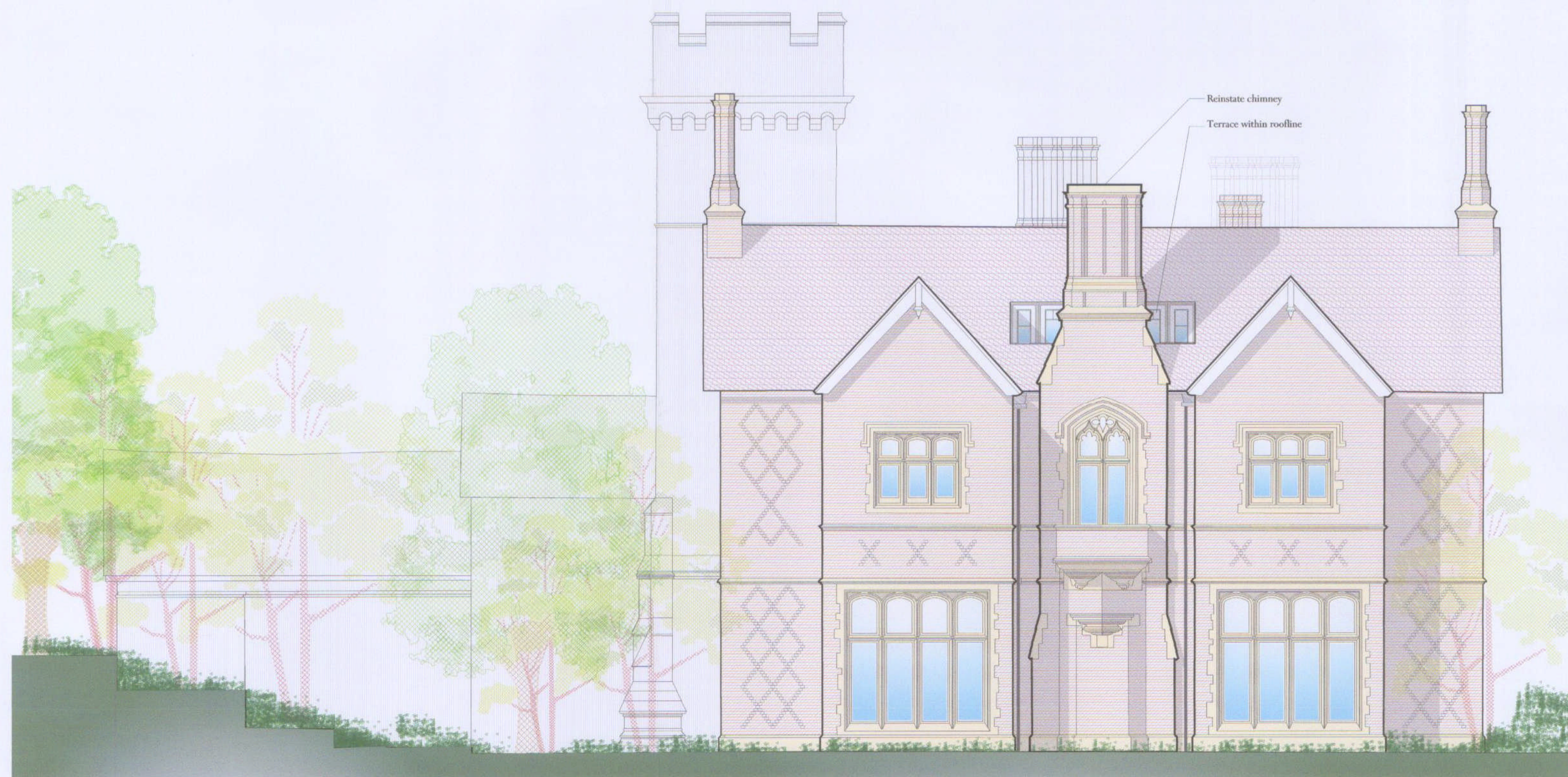
SOUTH ELEVATION B