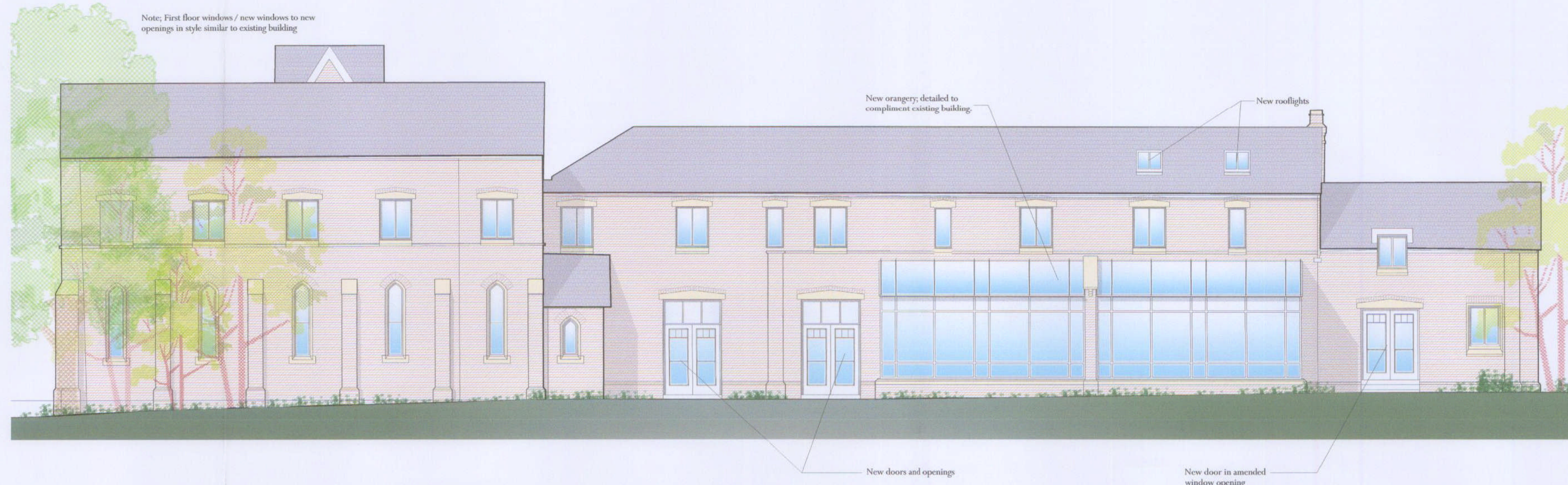
EAST ELEVATION G