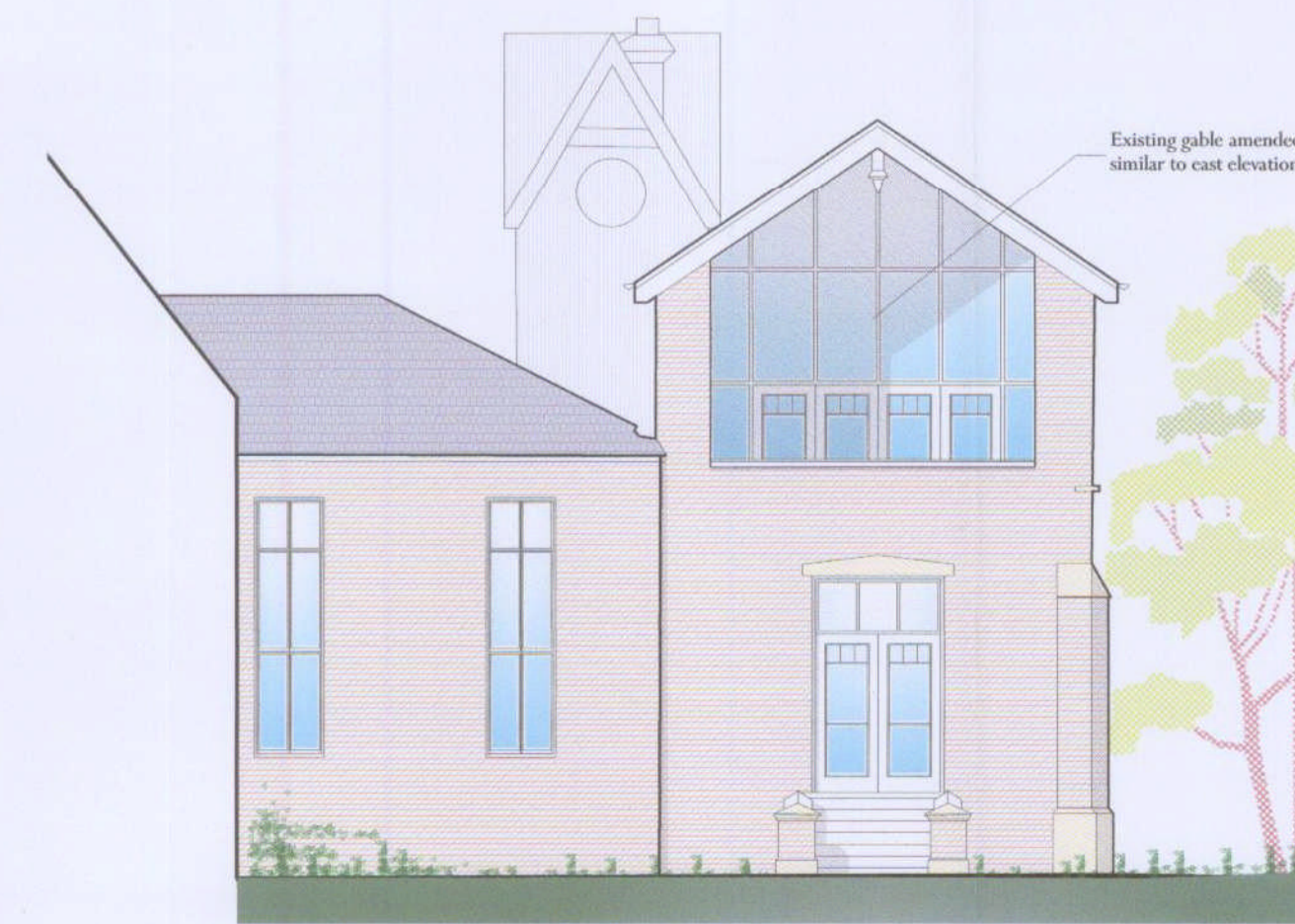
SOUTH ELEVATION C