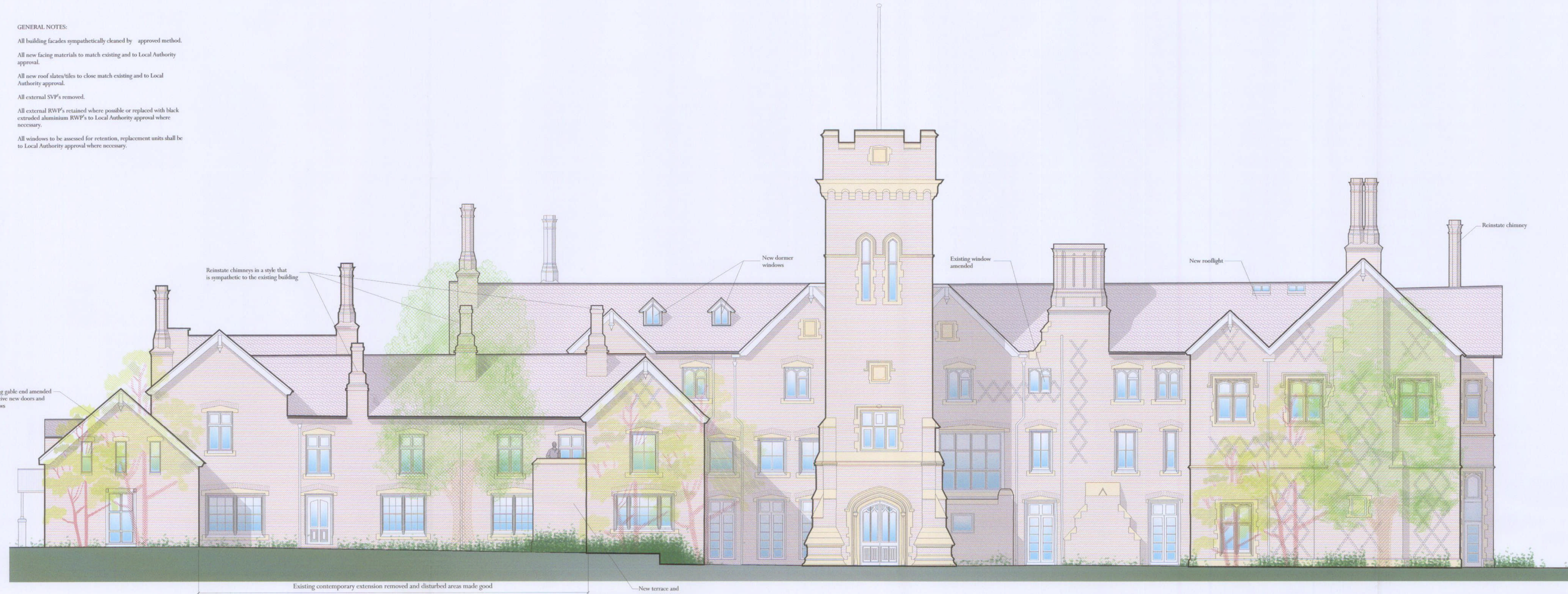
WEST ELEVATION A

GENERAL NOTES: All building facades sympathetically cleaned by approved method. All new facing materials to match existing and to Local Authority approval. All new roof slates/tiles to close match existing and to Local Authority approval. All external SVP's removed. All external RWP's retained where possible or replaced with black extruded aluminium RWP's to Local Authority approval where necessary. All windows to be assessed for retention, replacement units shall be to Local Authority approval where necessary.