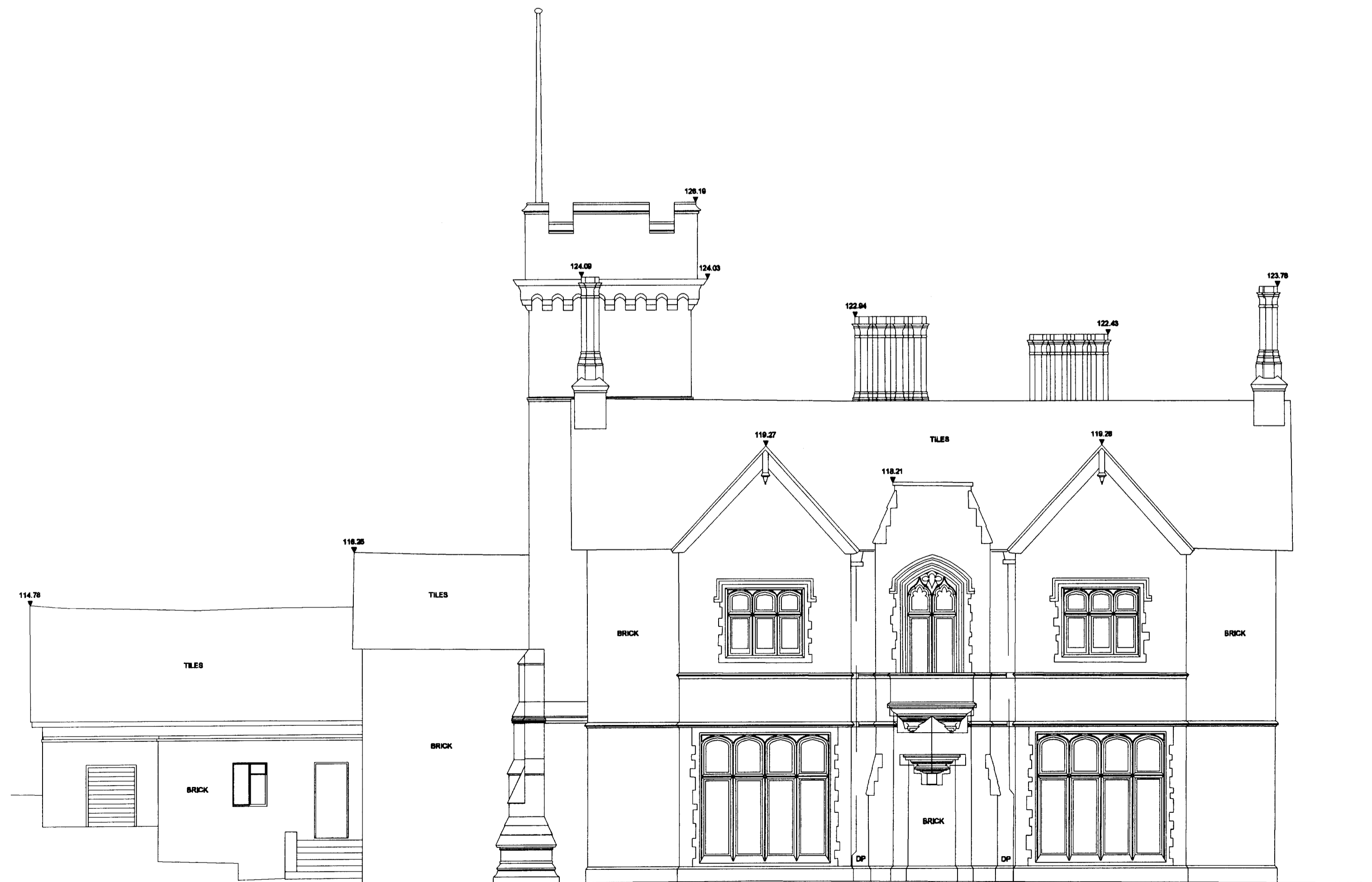
SOUTH ELEVATION B