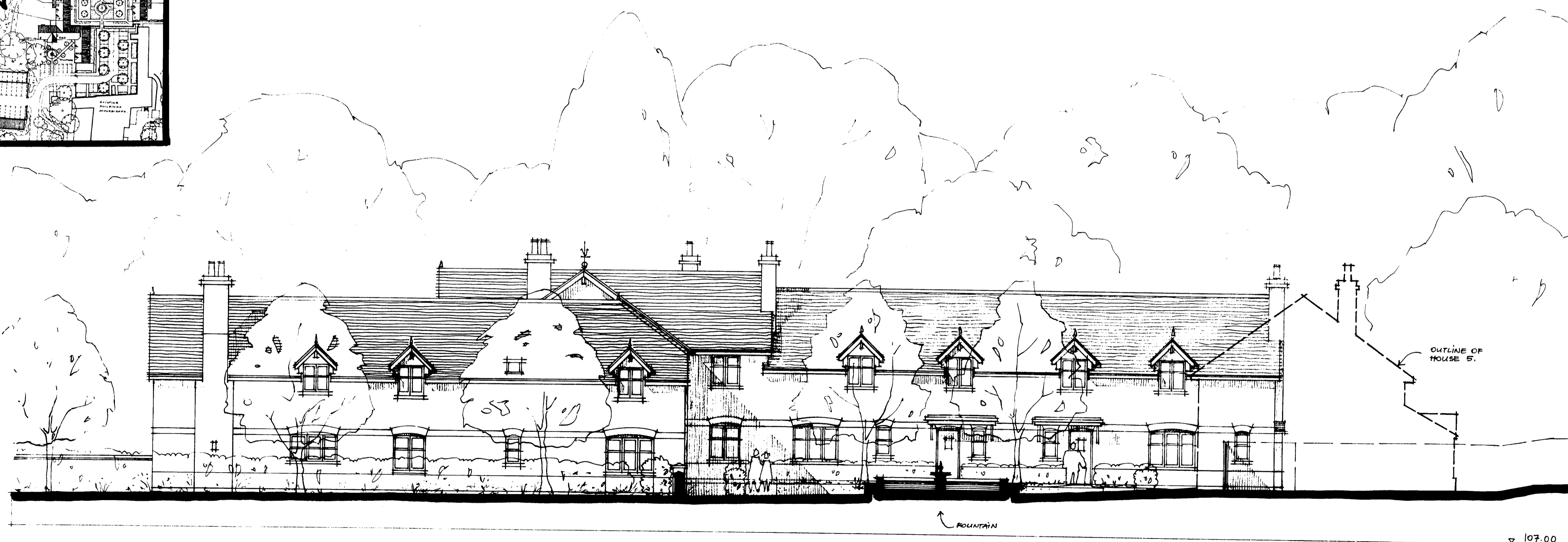
COURTYARD ELEVATION - EAST

NOTES ALL DIMENSIONS MUST BE CHECKED ON SITE AND NOT SCALED FROM DRAWING. ERRORS AND OMISSIONS TO BE REPORTED TO THE ARCHITECTS