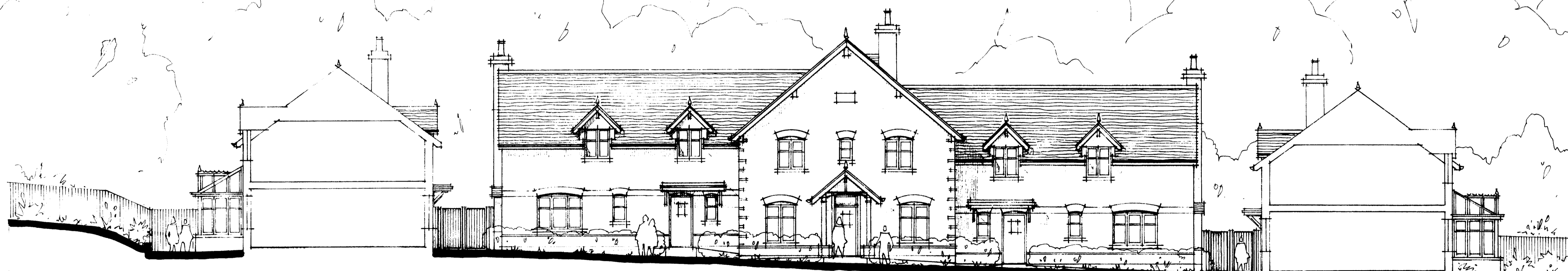
COURTYARD ELEVATION - SOUTH