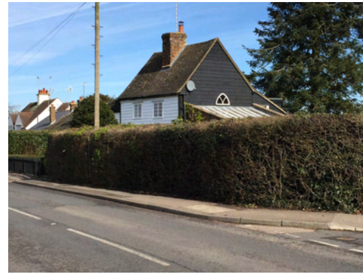
② Pond Cottage