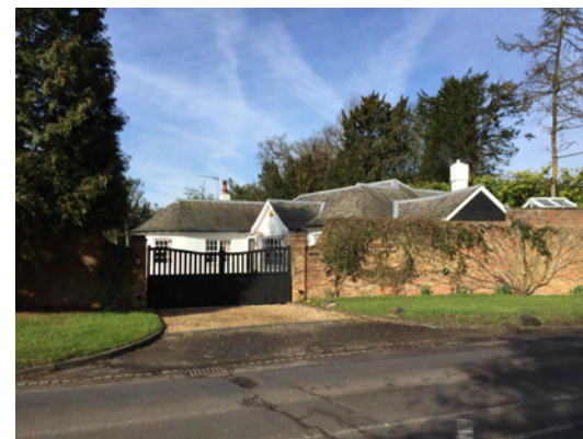
⑪ North Lodge