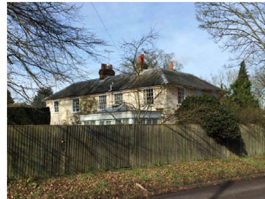
⑦ The Vines