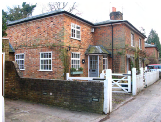
⑨ 10 & 8 High Road - Rose Cottage

The predominant materials for the external walls are painted render and red brick. There are two examples of houses with painted timber weatherboarding to the upper storey.