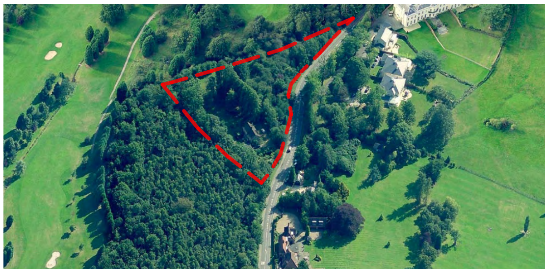
View from the north