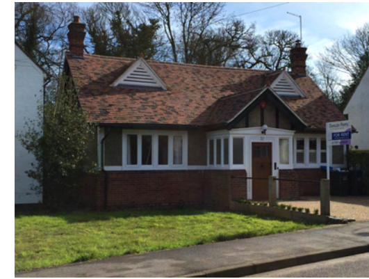
④ 32 High Road

We have carried out a photographic study of the houses on the south side of the village from Essendon House along High Road as far south as Essendon Place.