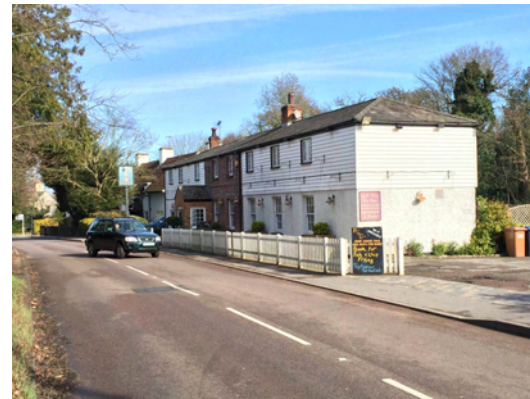
⑥ Rose & Crown