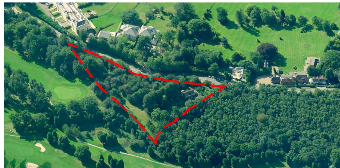
View from the east

These aerial views show just how very well screened the site is by trees and hedges on all sides.