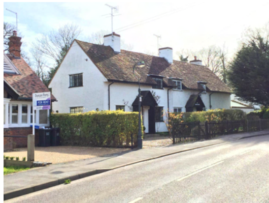
⑤ 30 & 28 High Road

The photographs shown on this page illustrate that the roofs of the houses are typically either pitched hipped roofs or pitched roofs with central ridges and gabled ends. There are just two houses with hipped roofs behind parapets: Essendon House and Essendon Place.