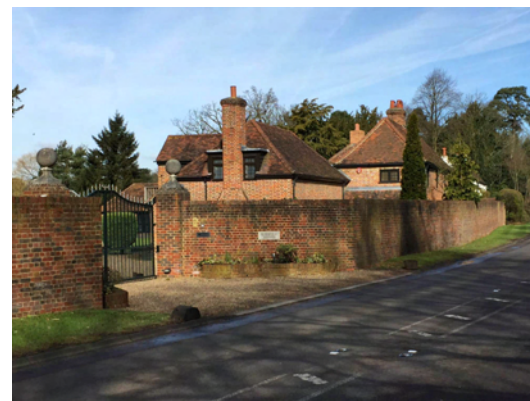
⑩ Essendon Manor