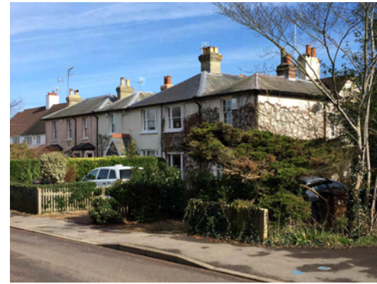
③ 42, 40 & 38 High Road