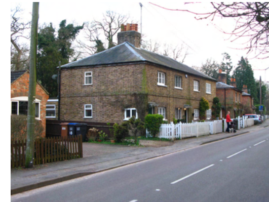
⑧ 16 & 14 & 12 High Road