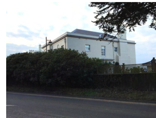
⑫ Essendon Place