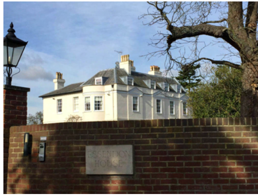
① Essendon House