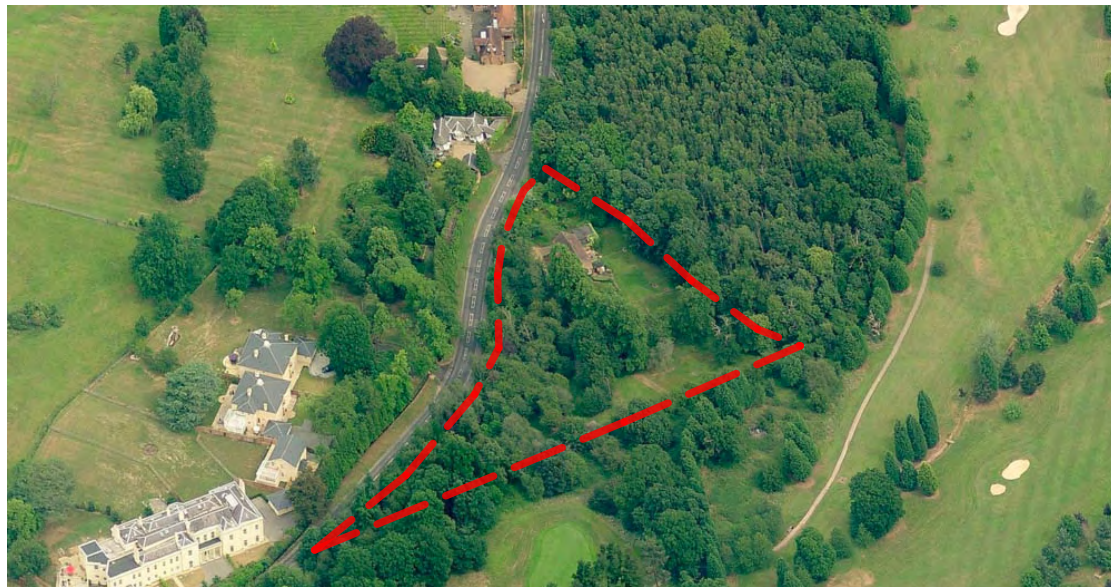
View from the south