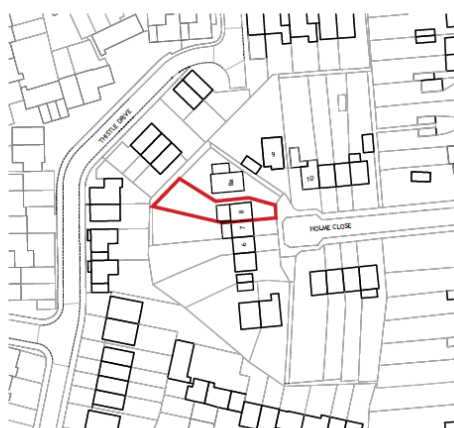
OS MAP SCALE 1:1250

COPYRIGHT © Atelier 41 Architects Ltd THIS DRAWING WHICH IS THE PROPERTY OF ATELIER 41 ARCHITECTS LTD IS THE SUBJECT OF INTELLECTUAL PROPERTY RIGHTS INCLUDING COPYRIGHT AND DESIGN RIGHTS AND SHALL NOT BE REPRODUCED, LOANED, COPIED OR SUBMITTED TO ANY OTHER PARTY WITHOUT THE WRITTEN CONSENT OF BURO ONE ARCHITECTS LTD