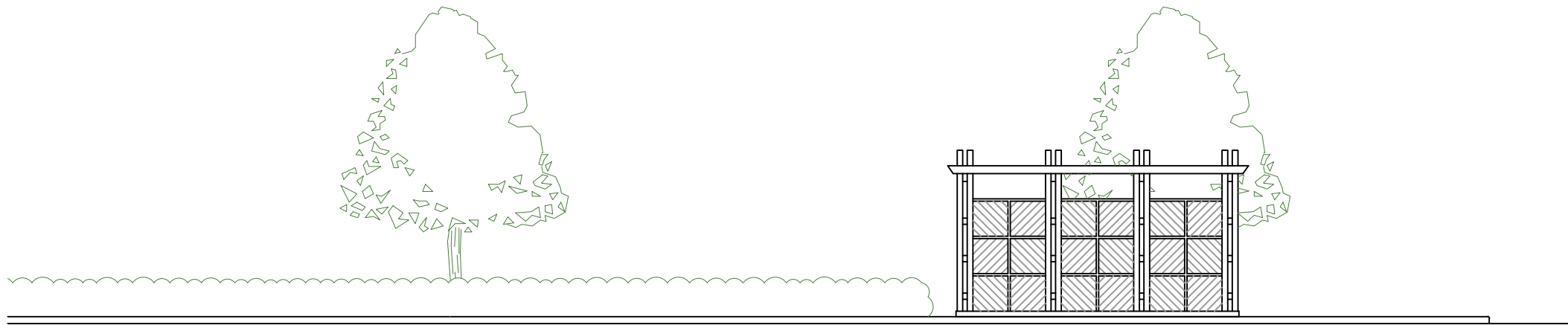
Existing Elevation 1