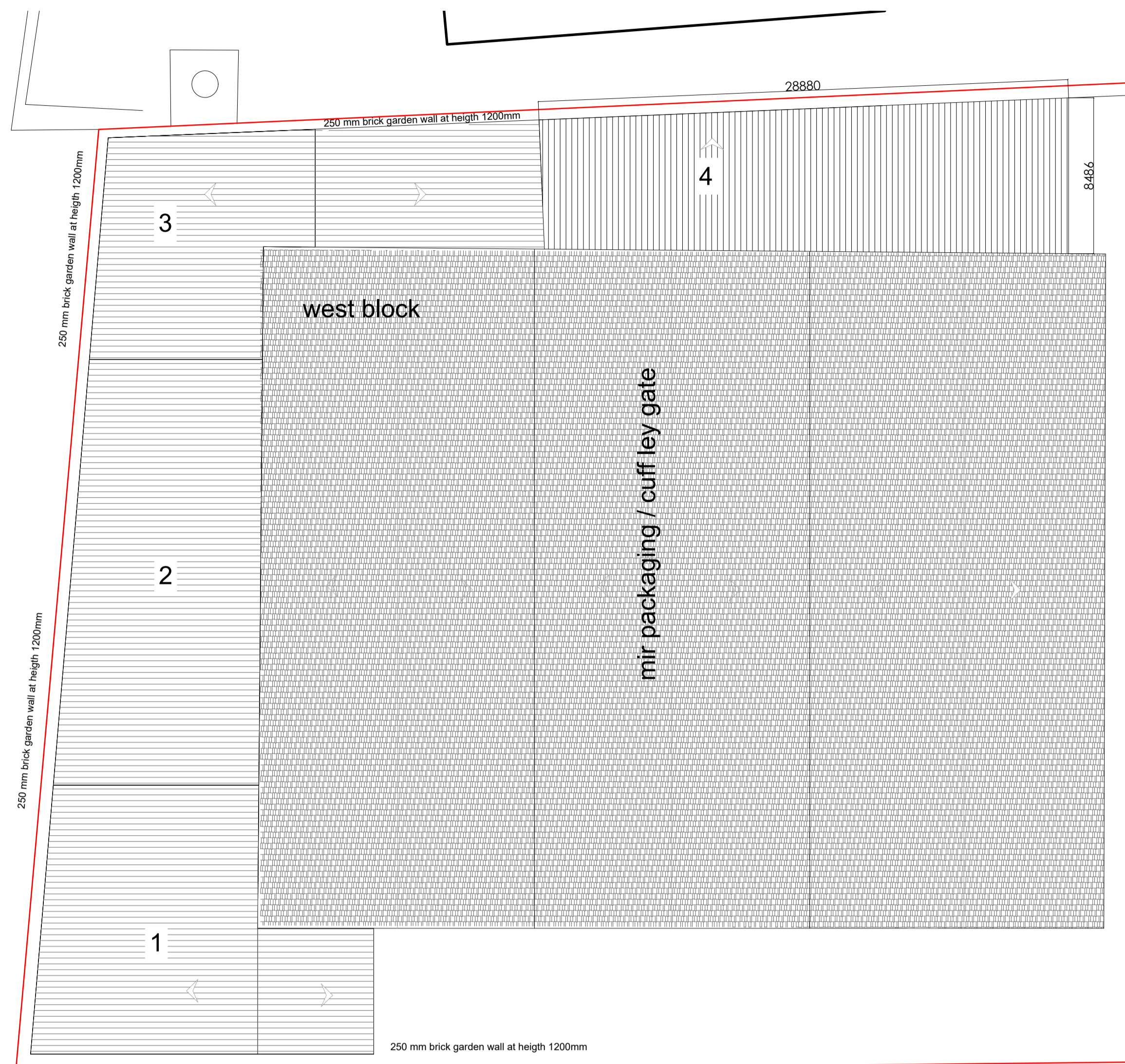
EXISTING ROOF PLAN MANUFACTURE 1:200