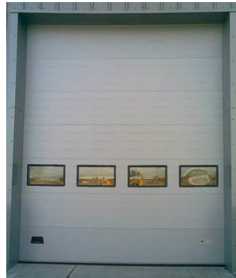
Image 4; Typical vehicular access door - aluminium colour RAL 7016 – anthracite grey