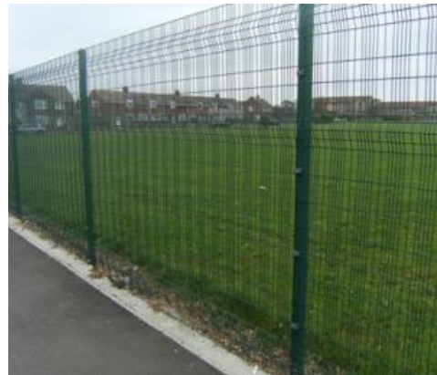
Image 5; Typical paladin boundary security fencing polyester powder coated steel – colour RAL 6005 – green