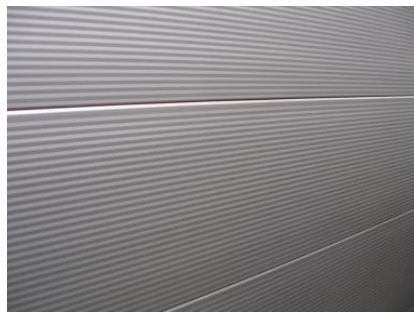
Image 2; typical workshop elevations – composite cladding colour RAL 9006 – silver grey