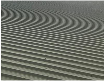
Image 1; Profiled composite metal cladding roofing system – colour RAL 7038 Goosewing Grey.