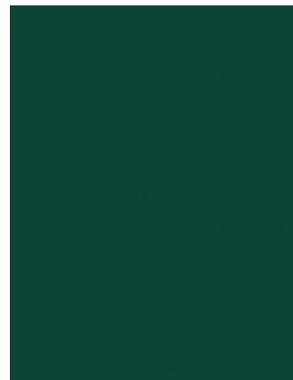
RAL 6005 green

Physical samples of the proposed hard landscaping will be available at the Hatfield Park Office in due course.