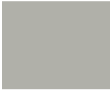
RAL 7038 Goosewing Grey.