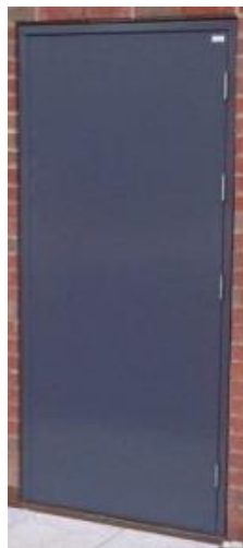
Image 3; Typical personnel door - steel colour RAL 7016 – anthracite grey