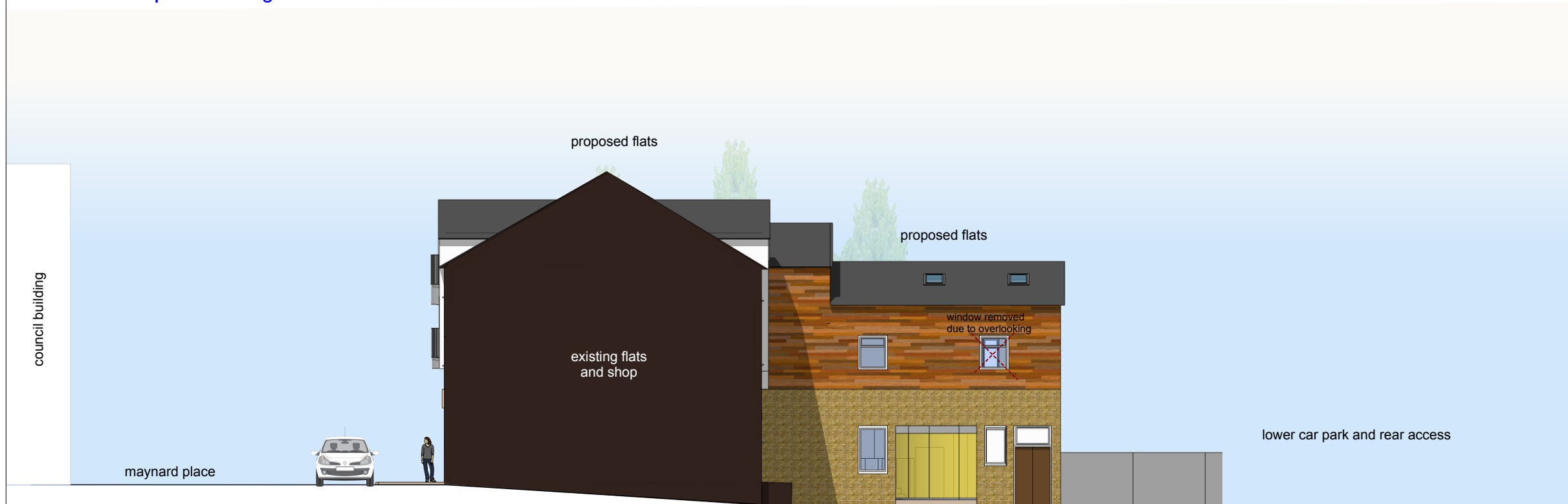
elevation | south facing

caveat: roof heights are based on brick counts and should be treated as approximate the proposal follows the existing roof ridge line terminating at the dormers.