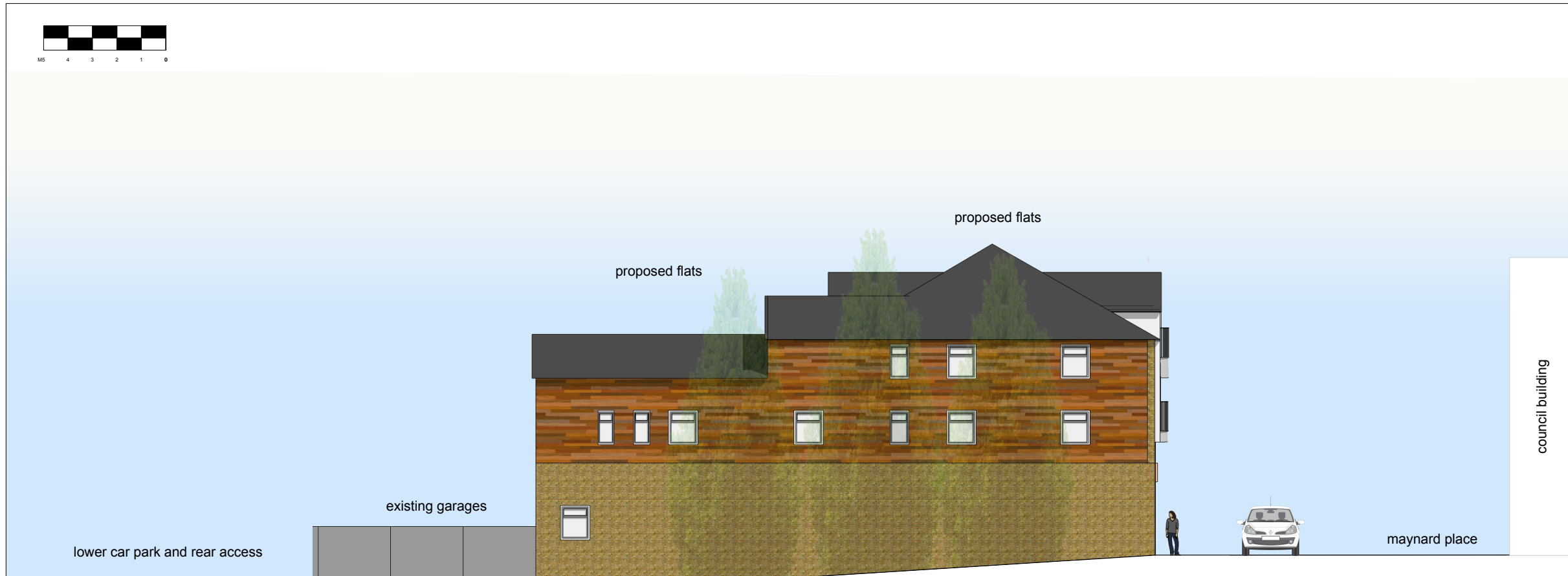
elevation | north facing