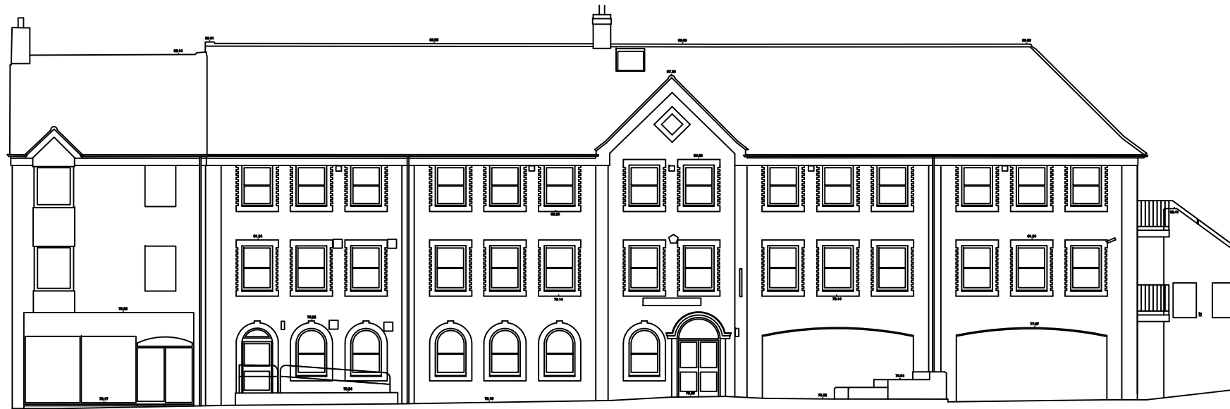
02 ELEVATION 02 SCALE: 1:100 @ A3