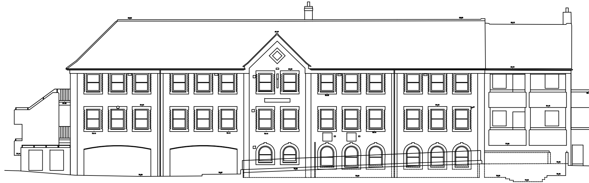
01 ELEVATION 01 SCALE: 1:100 @ A3