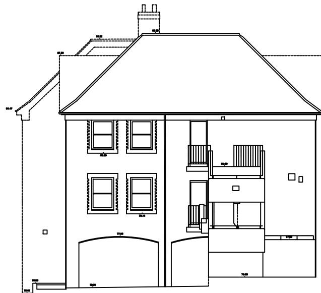
03 ELEVATION 03 SCALE: 1:100 @ A3