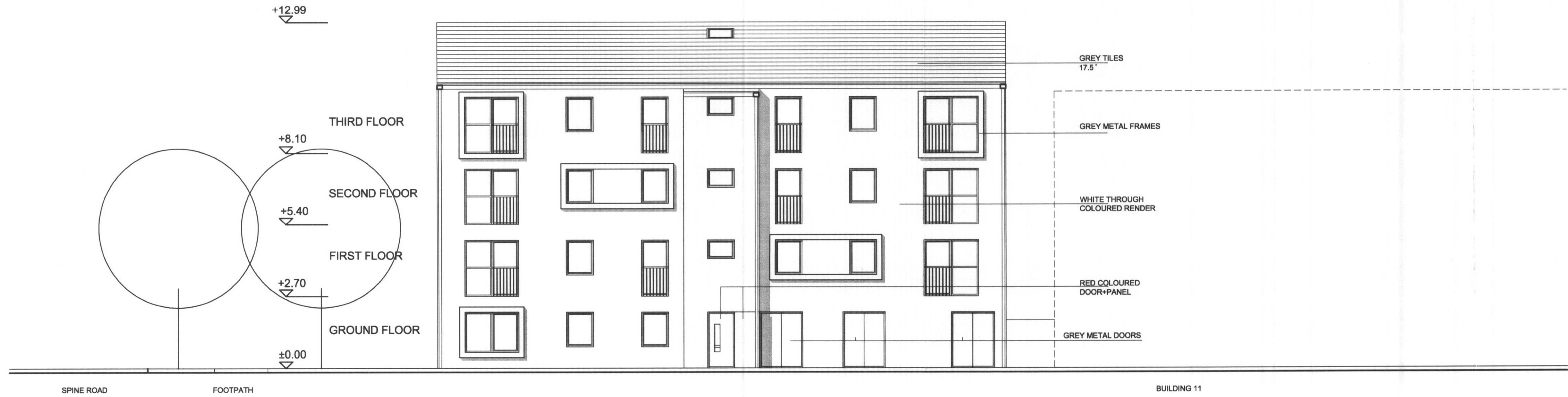
B12 - SOUTH WEST ELEVATION