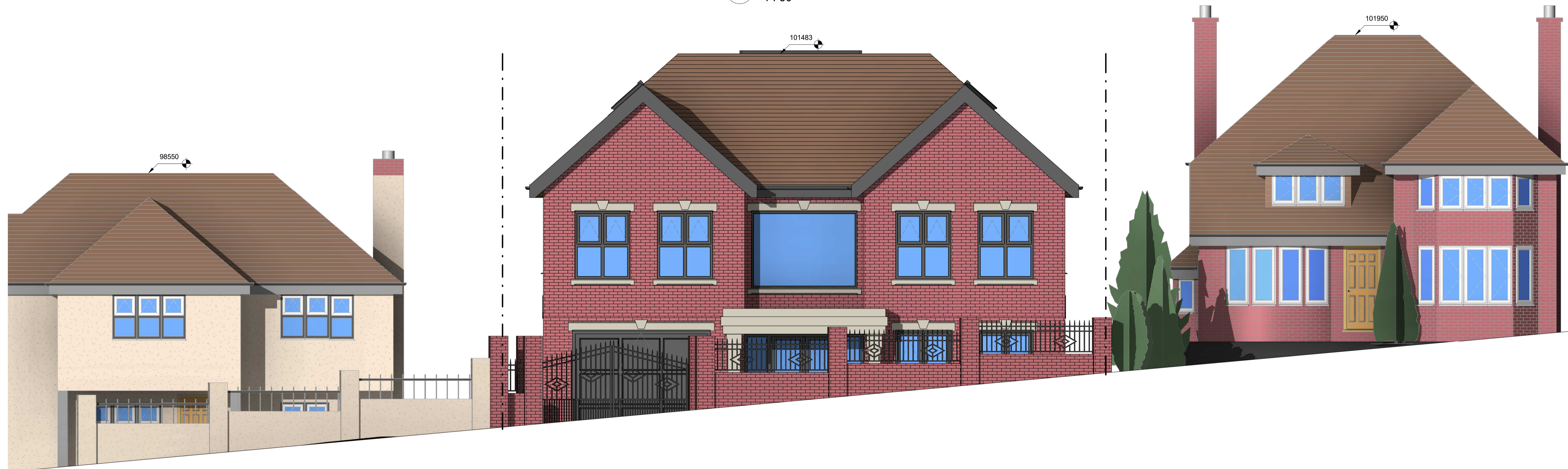
1 Street View 1 : 50