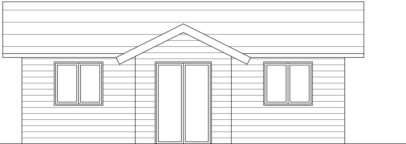
As built Front Elevation