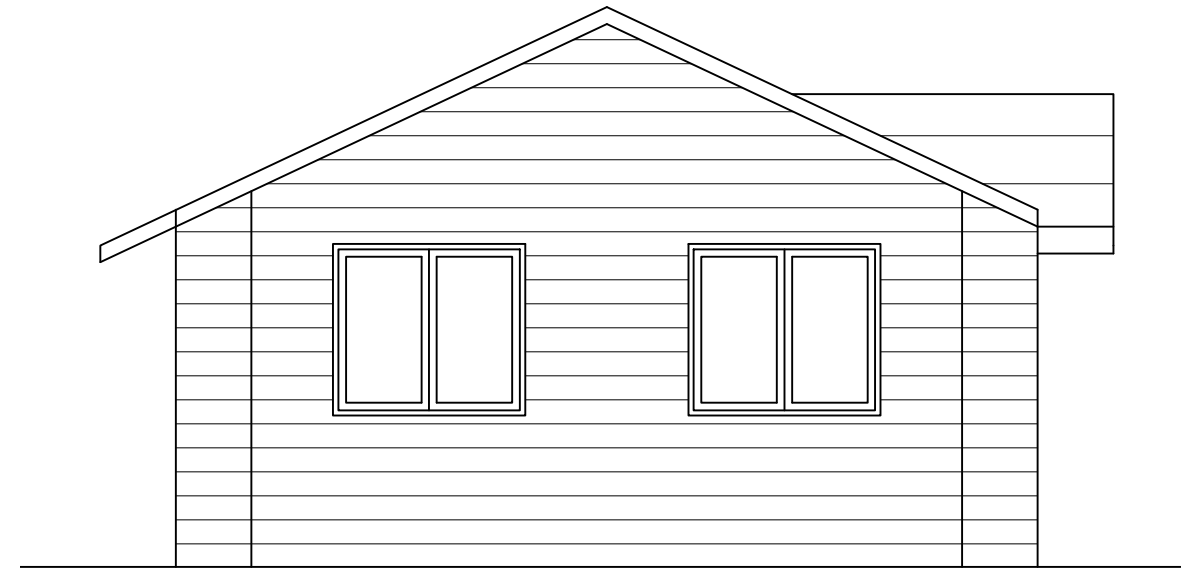
As built Side Elevation