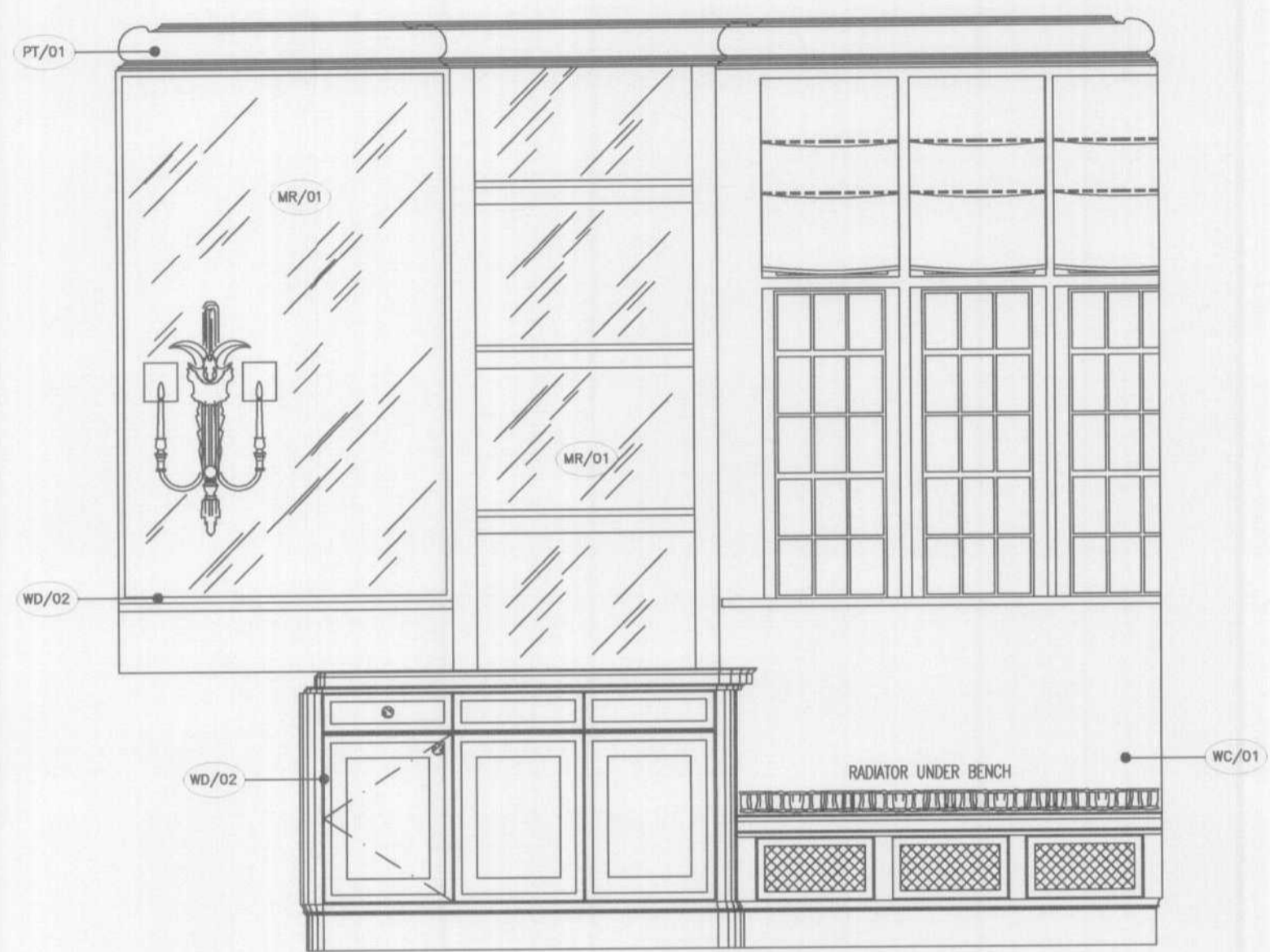
POWDER ROOM ELEVATION 1 room 1.05