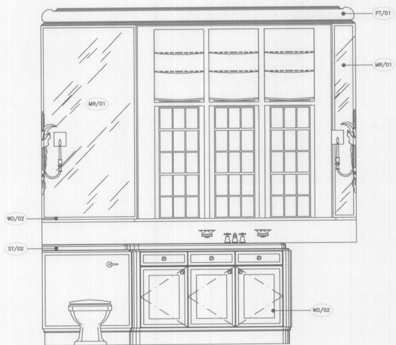
POWDER ROOM ELEVATION 3 room 1.05