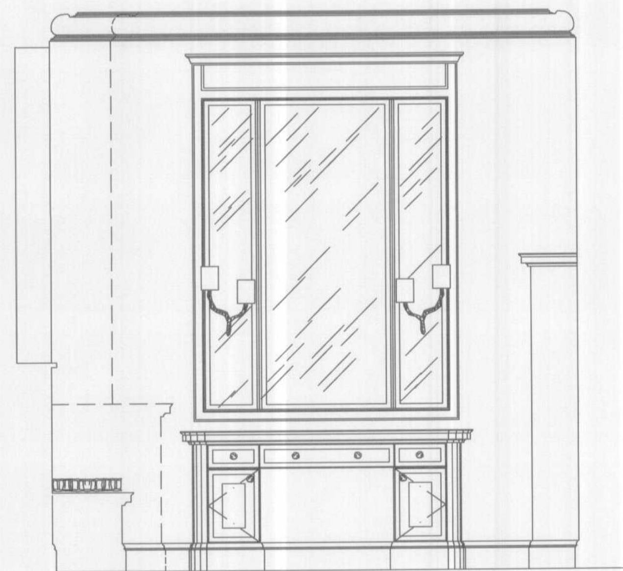
POWDER ROOM ELEVATION 4 room 1.05

WELWYN HATFIELD PLANNING OFFICE COPY 21 JAN 2008 No: So/2008/118/LB