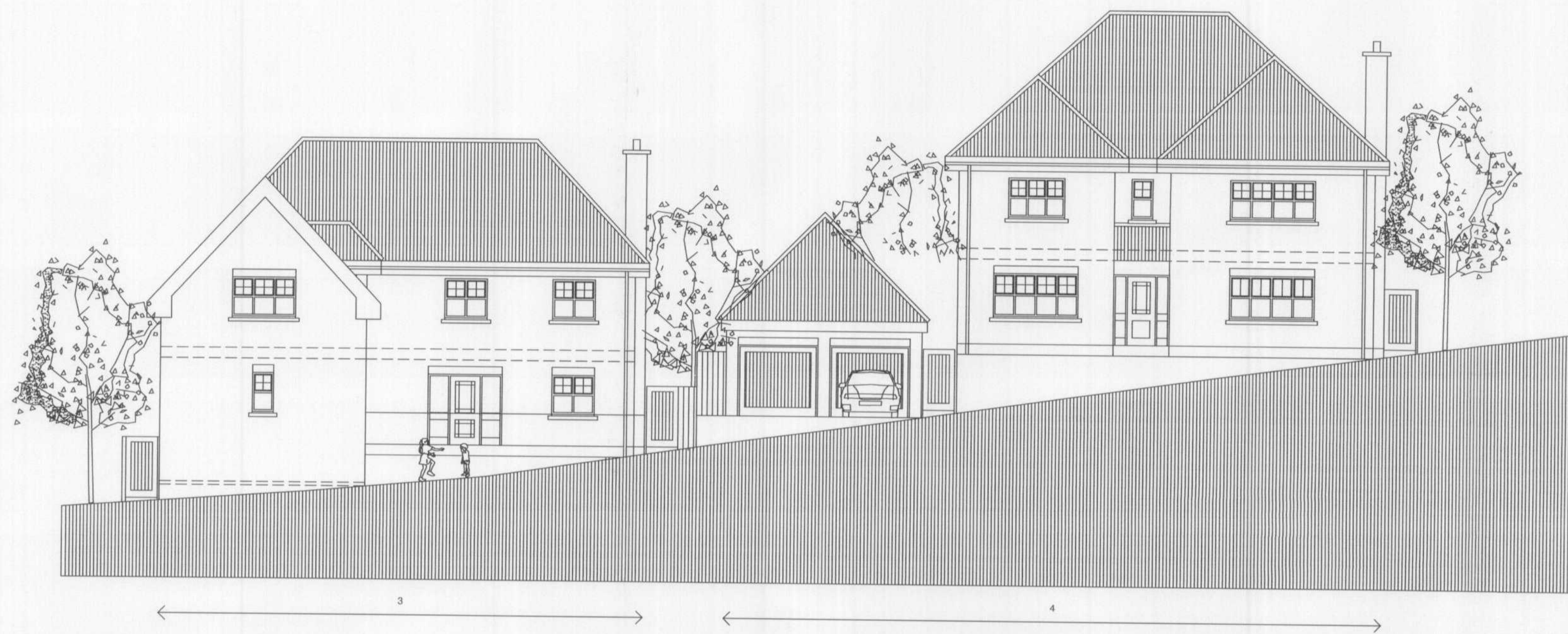
PLOTS 3 AND 4 - FRONT ELEVATIONS