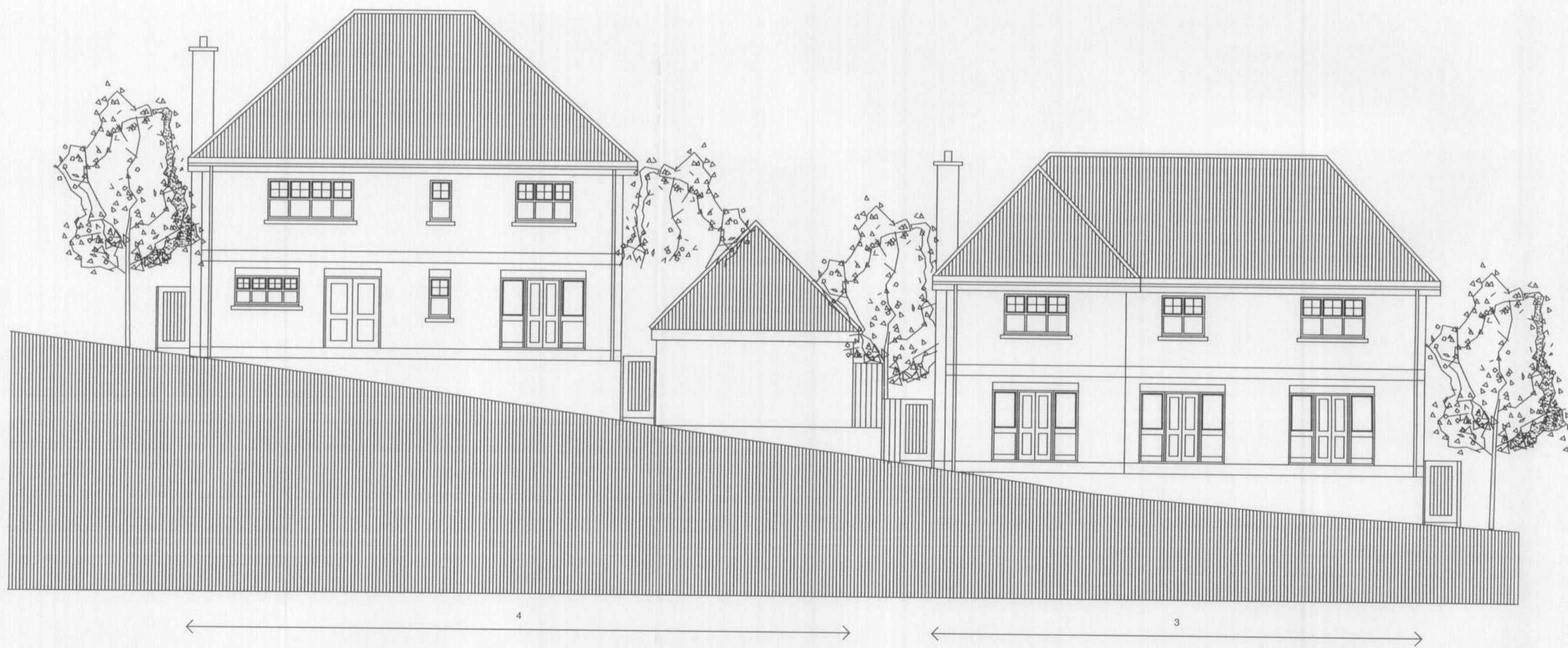
PLOTS 3 AND 4 - REAR ELEVATIONS