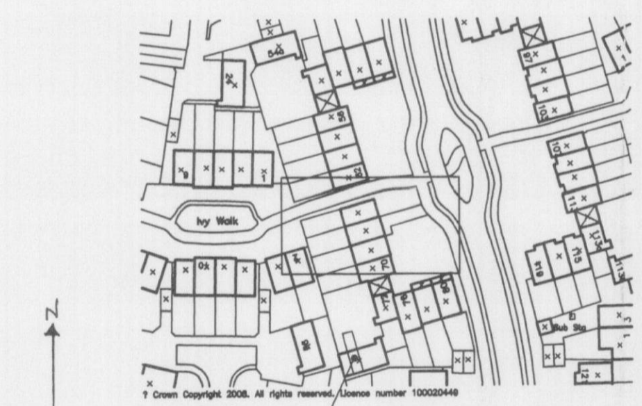
Leashold garage and parking bay for No. 66 shown outlined in blue Location Plan 1:1250