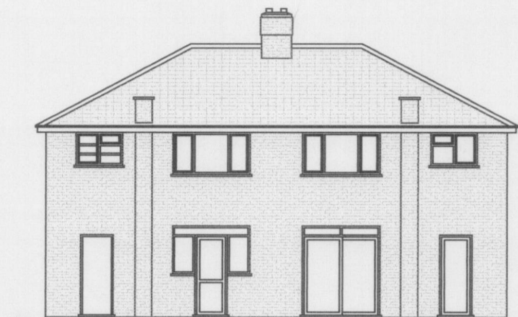
Existing Rear Elevation (North)