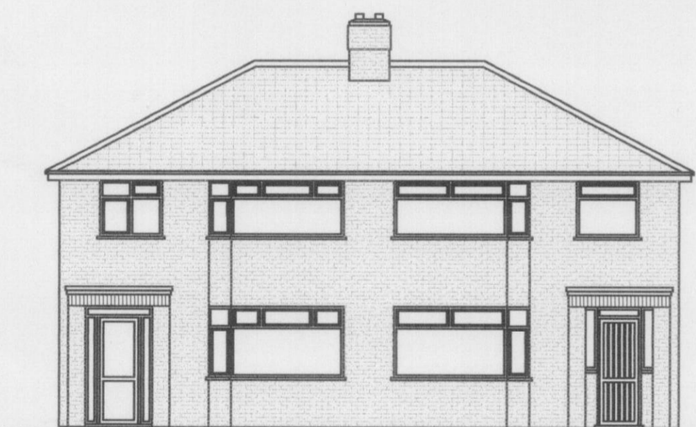
Existing Front Elevation (South)