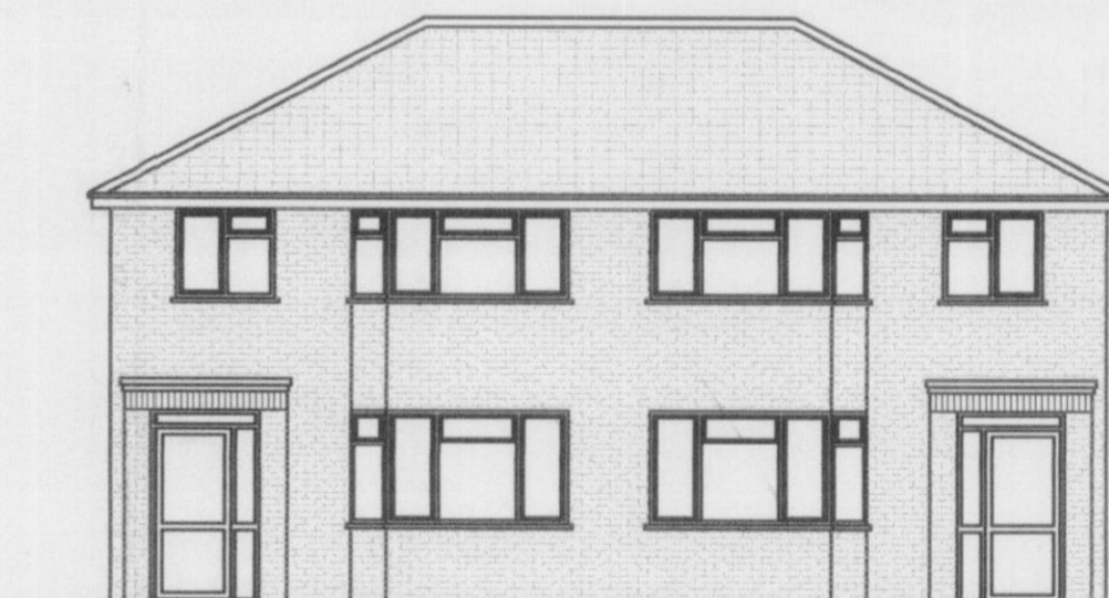
Proposed Front Elevation (South)

WELWYN HATFIELD PLANNING OFFICE COPY 21 OCT 2008 No: 56/2008/2007/FP 0 1 2 3 4 5