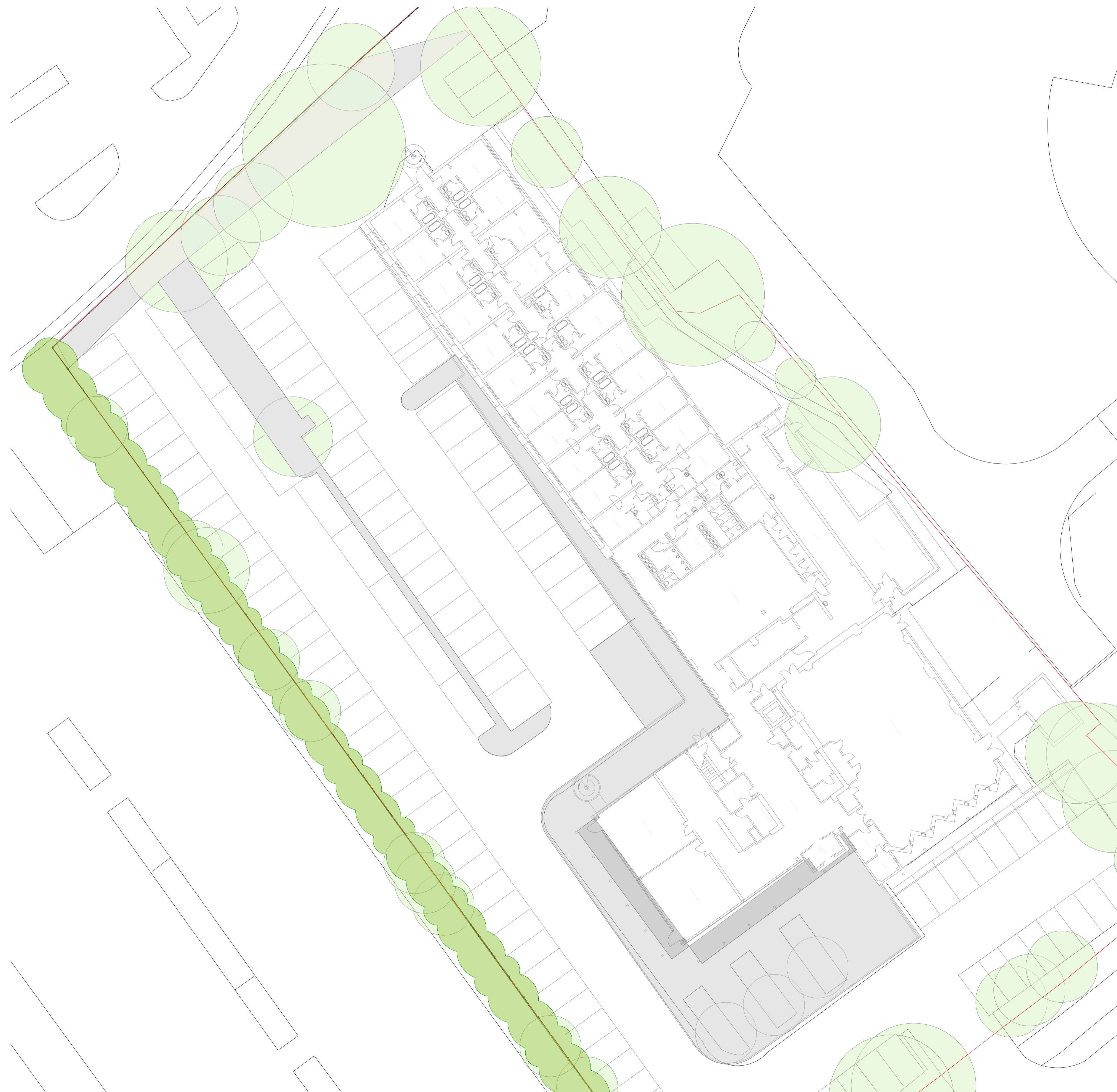
00 Existing Ground Floor Plan 1 : 200

Job Title Beales Hotel, Comet Way, Hatfield, AL10 9NG