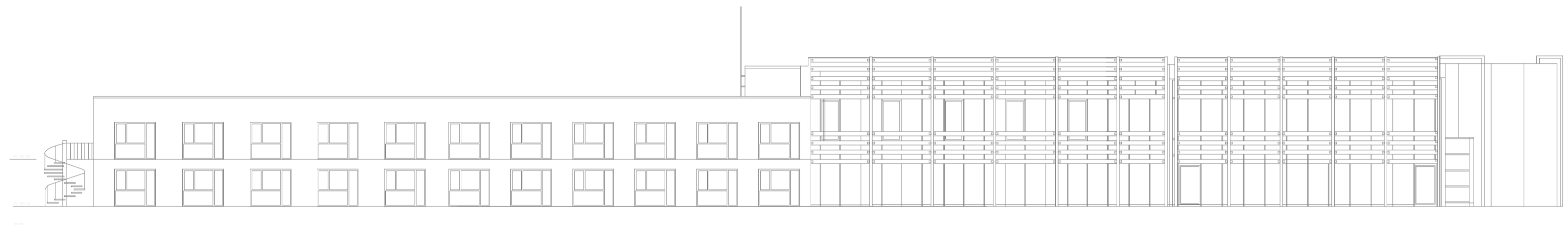
SIDE A ELEVATION