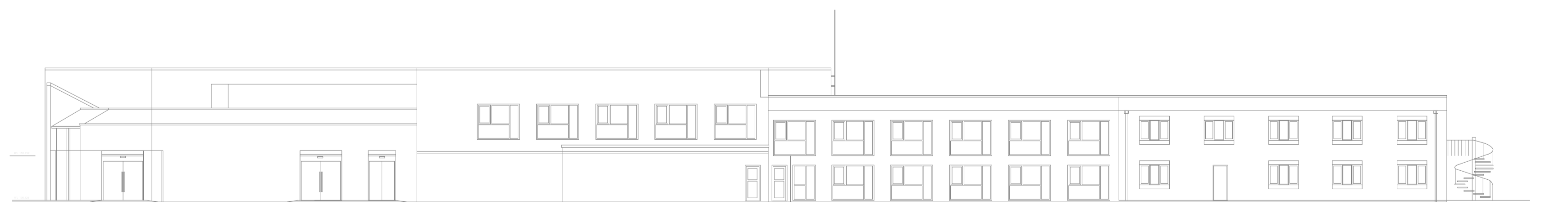
SIDE B ELEVATION