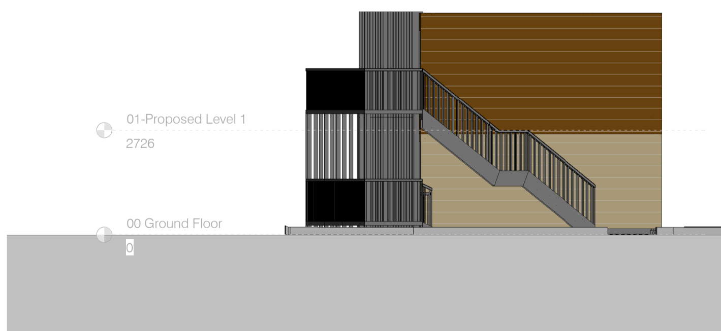
03 South West Elevation 1 : 100