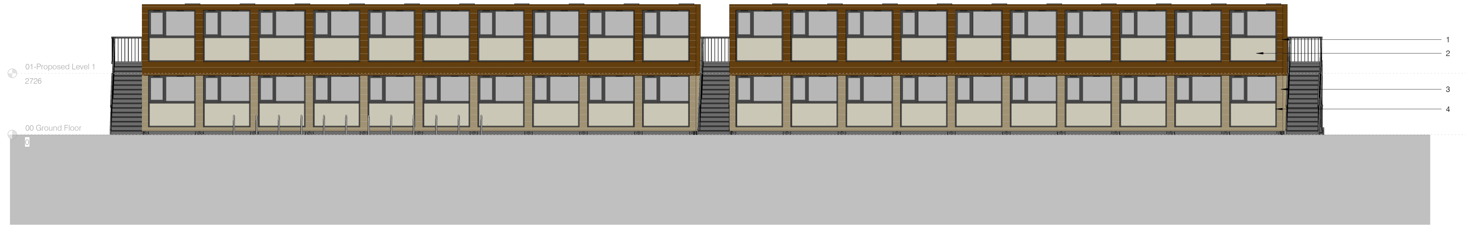
01 North East Elevation 1 : 100