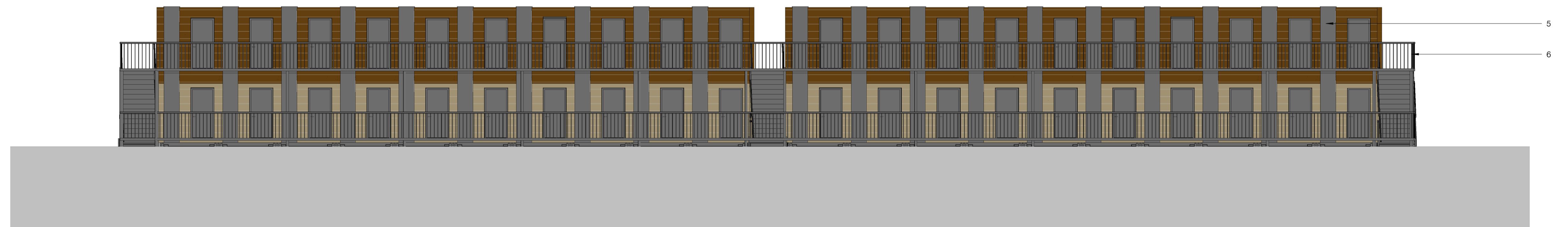
02 North West Elevation 1 : 100