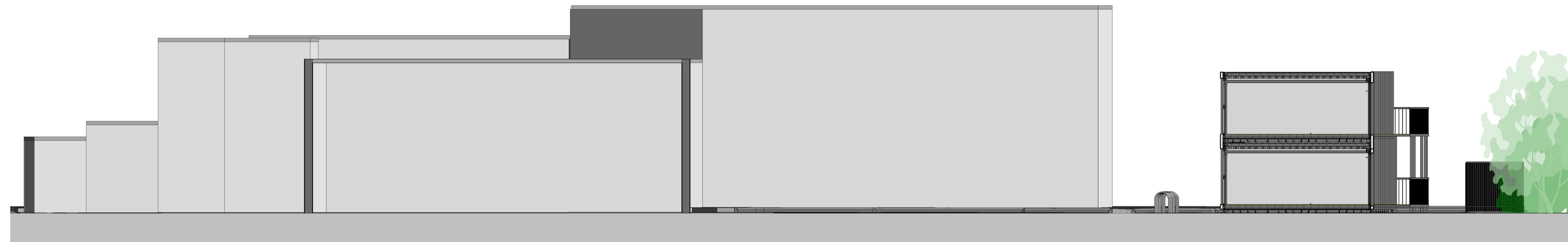
Existing Beales Hotel Cut Through