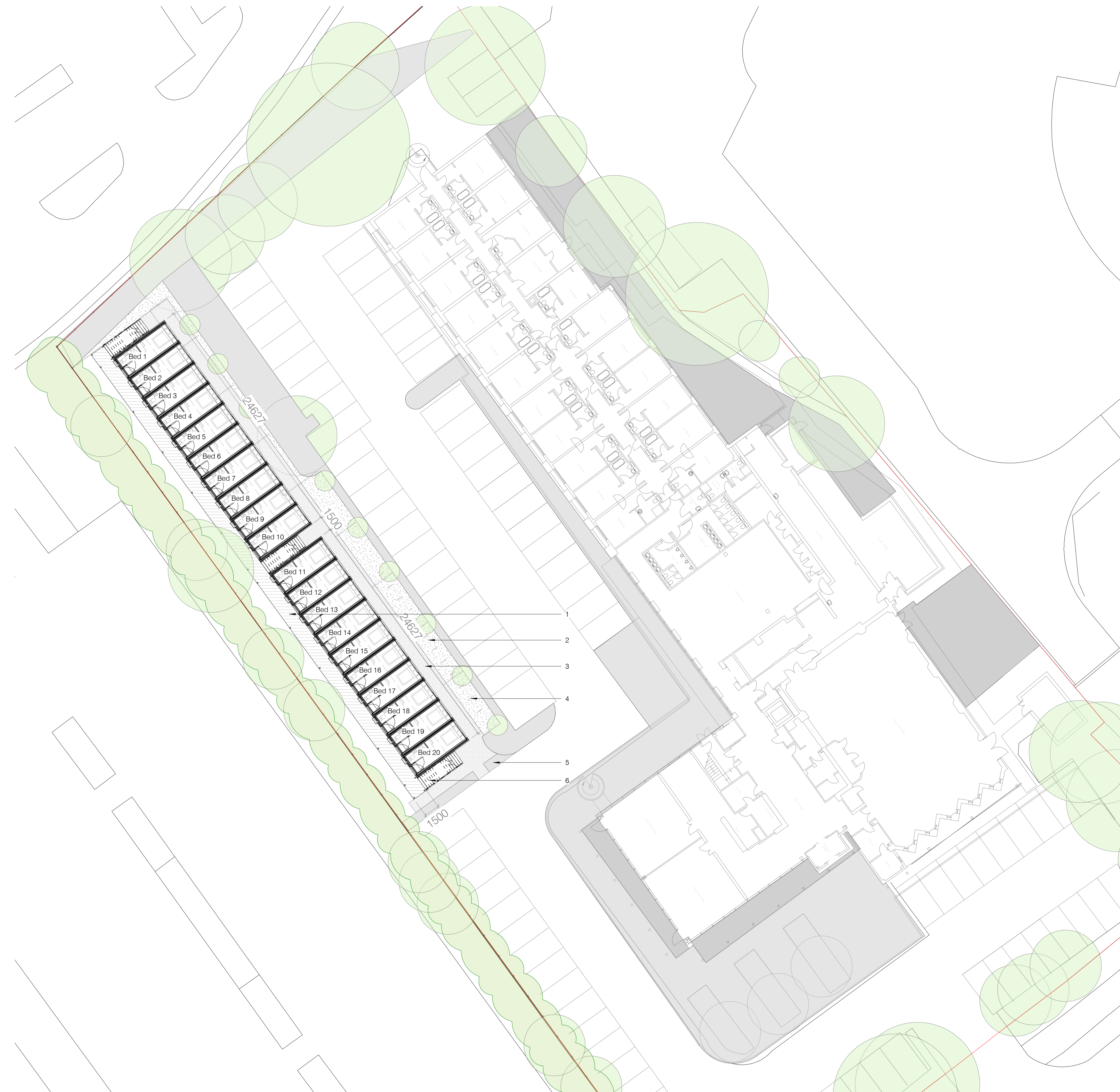
00 Proposed Ground Floor Plan 1 : 200