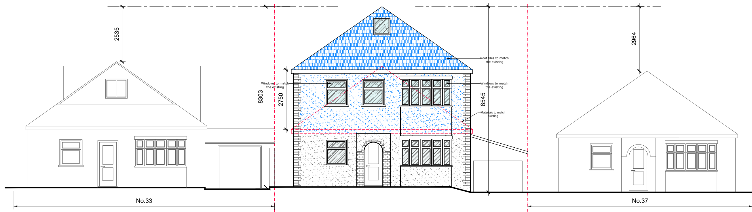
PROPOSED STREET VIEW