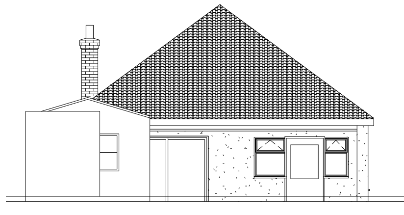
EXISTING SIDE ELEVATION - NORTH EAST 1:100