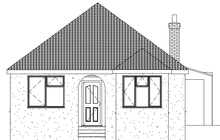
EXISTING SIDE ELEVATION - SOUTH WEST 1:100