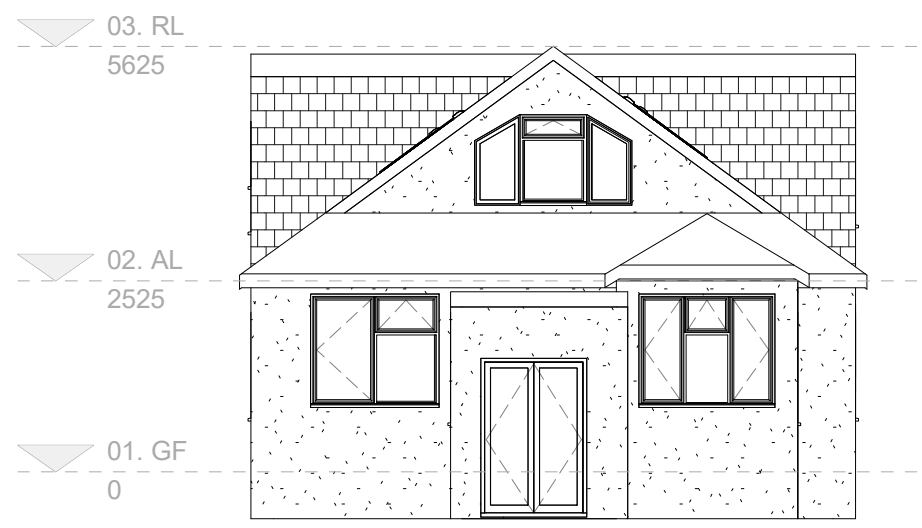
01. Front Elevation Existing 1 : 100