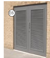
E6 New metal louvred door PPC coated Dark Grey