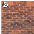
R2 Brickwork to match existing