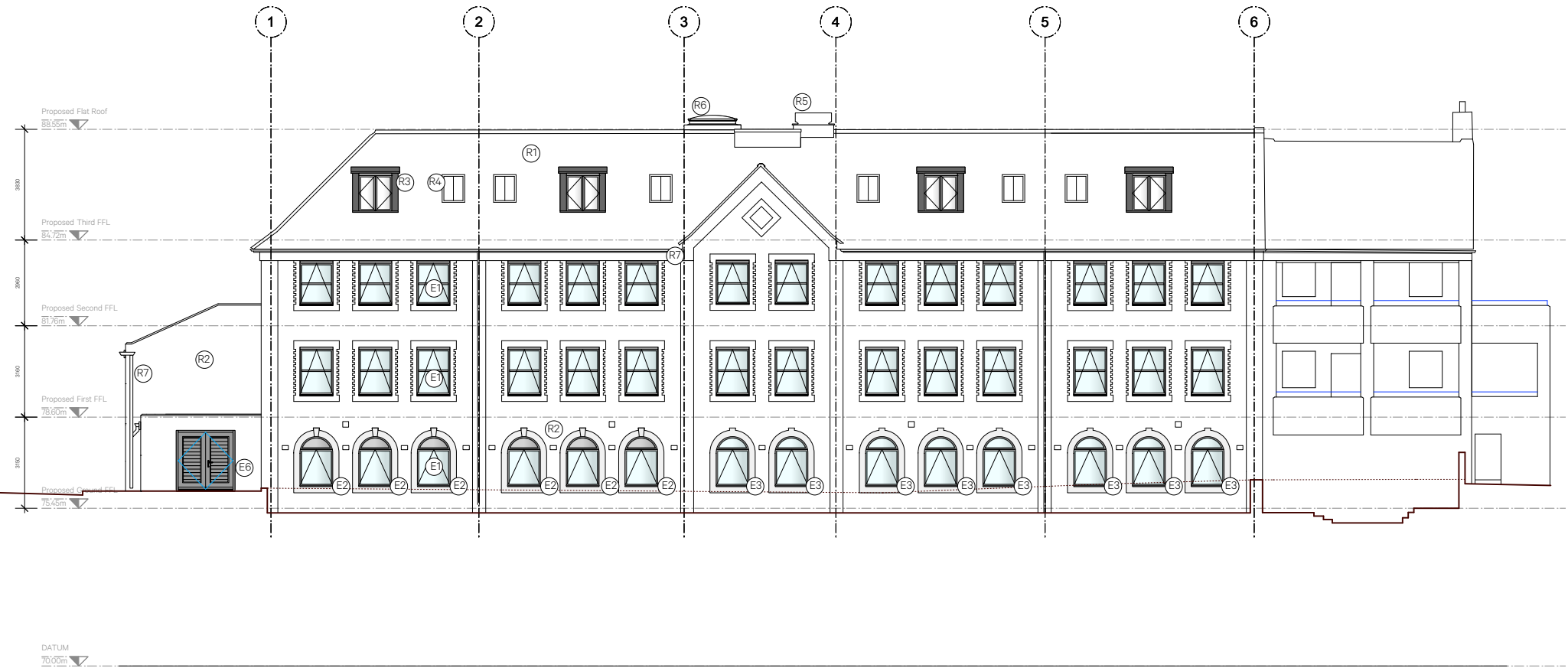
1 West Elevation 1:100