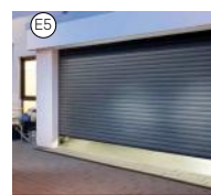
Roller Bike Store Door Dark Grey