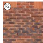
Brickwork to match existing