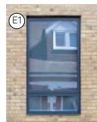
Aluminium composite windows Dark Grey