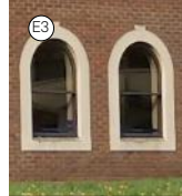
Exg Stone Surrounds Extended to ground level. To match exg.