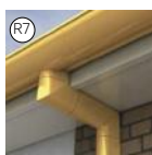
Alumasc Aqualine Half Round Gutter Dark Grey