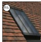
The Conservation Rooflight The Conservation Rooflight Company