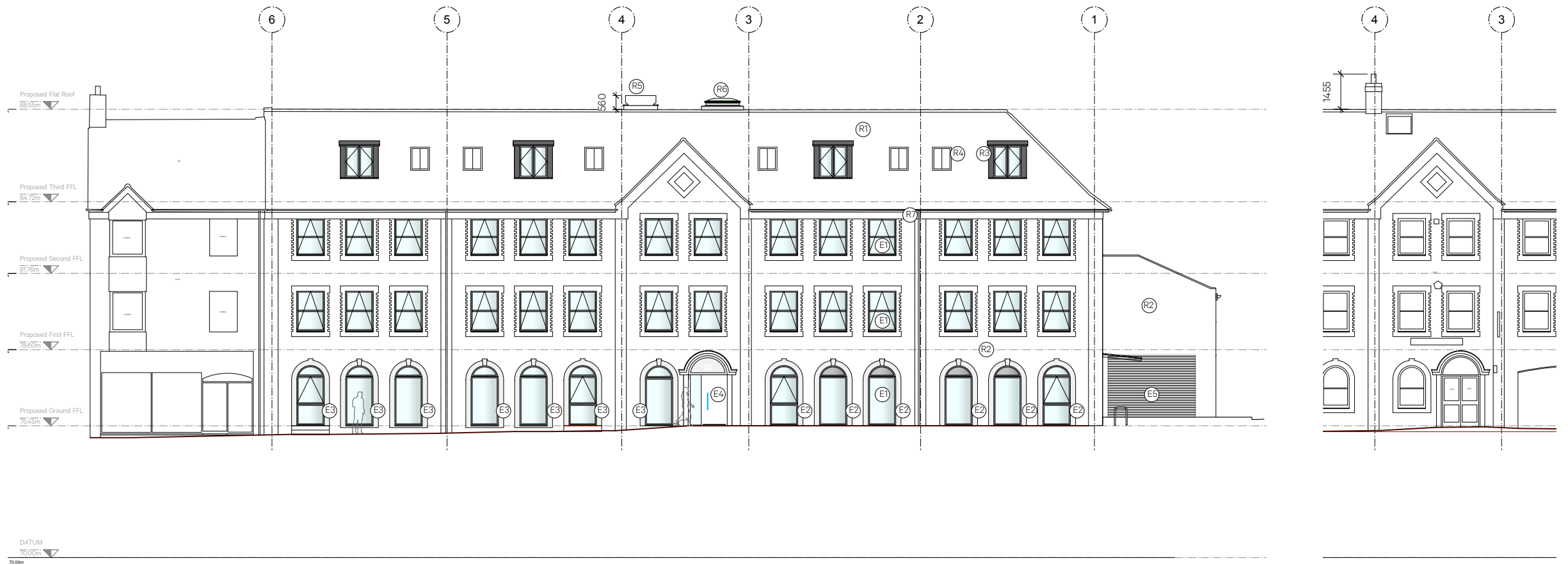
1 East Elevation 1:100