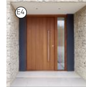
Hardwood Communal Front door Oak with glazed side panel