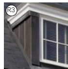
Lead Flat Roof Dormer