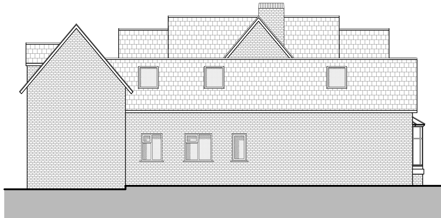
Side Elevation As Existing - Scale 1:100