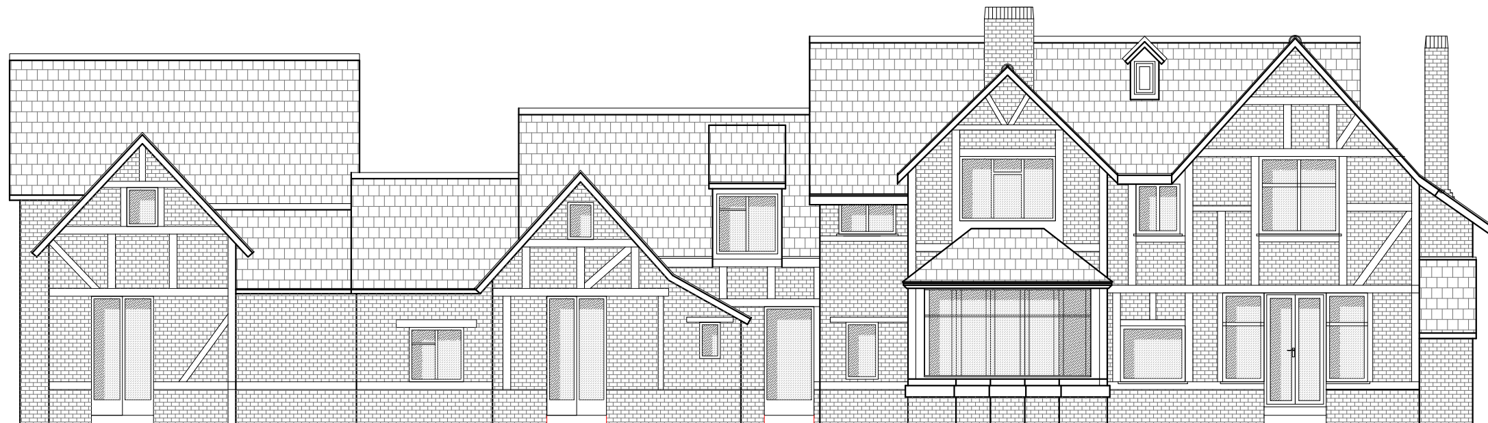
Rear Elevation As Existing - Scale 1:100