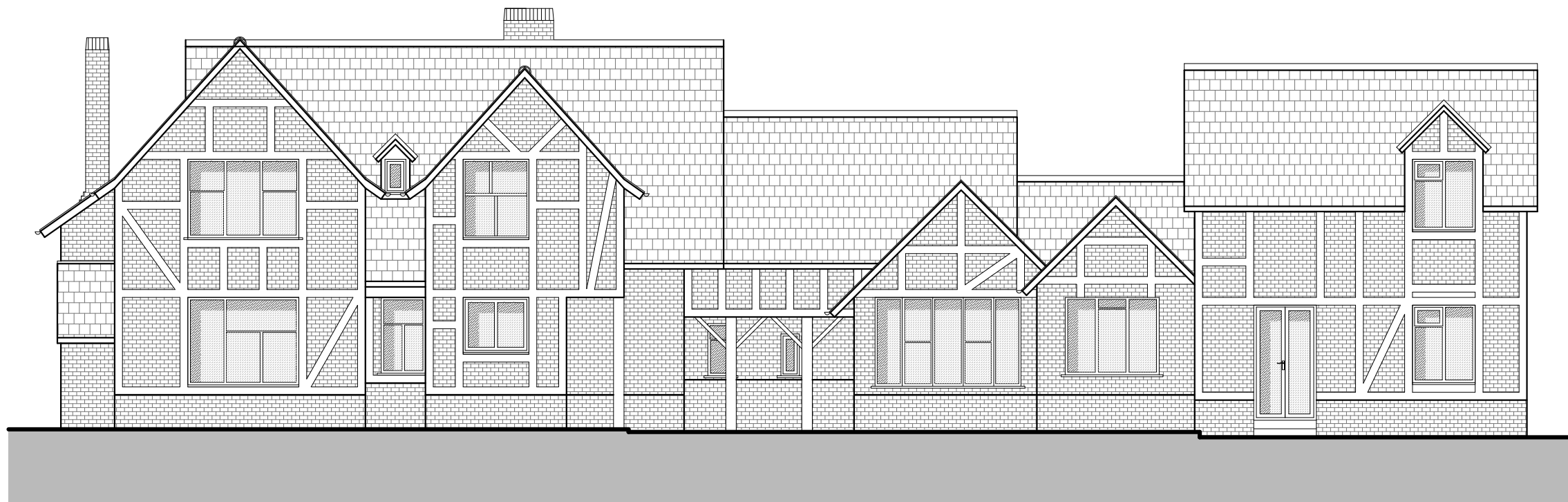
Front Elevation As Existing - Scale 1:100