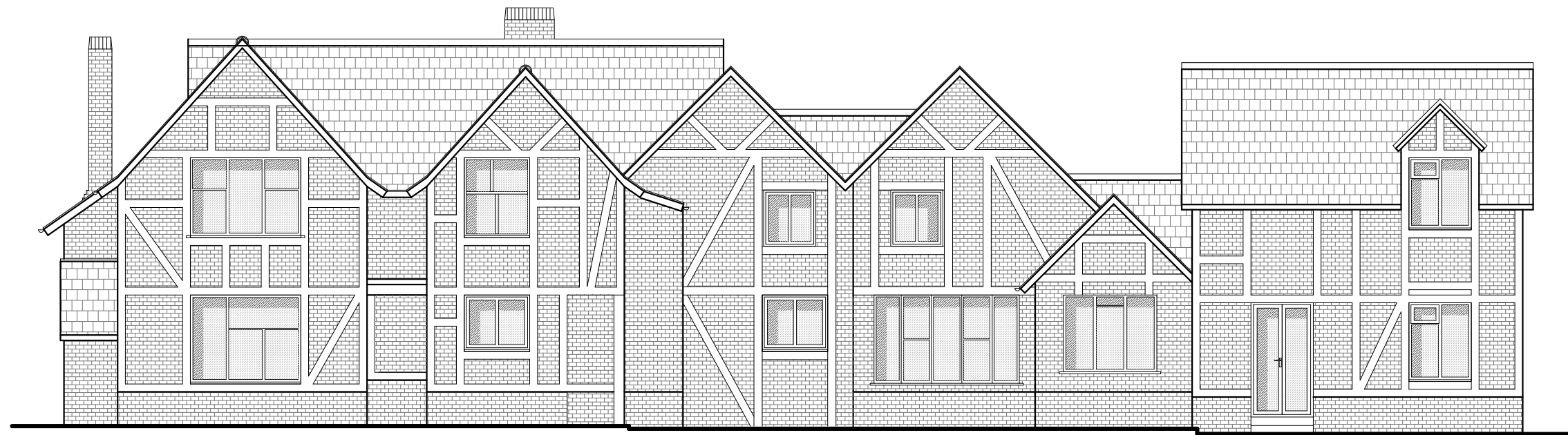
Front Elevation As Proposed - Scale 1:100