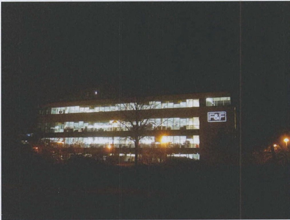
Photo 7: View from Mosquito Way of F&F Building with illuminated sign