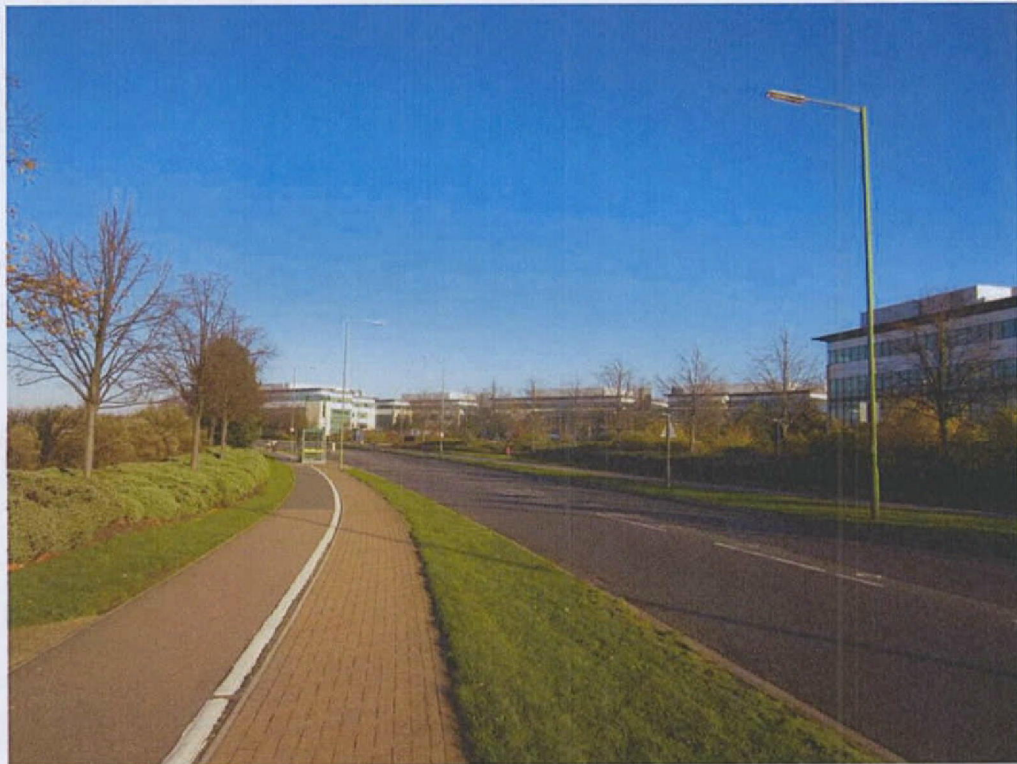
Photo 4: View of wider street scene, looking north east along Mosquito Way