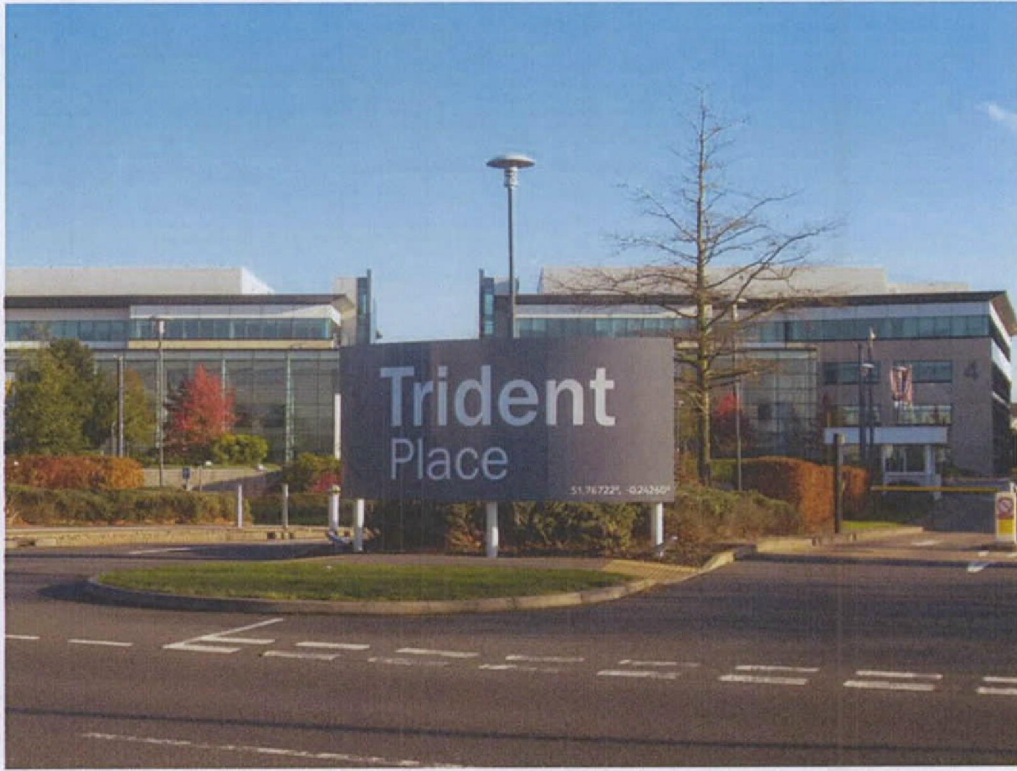
Photo 3: Trident Place office development, located on the opposite side of Mosquito Way