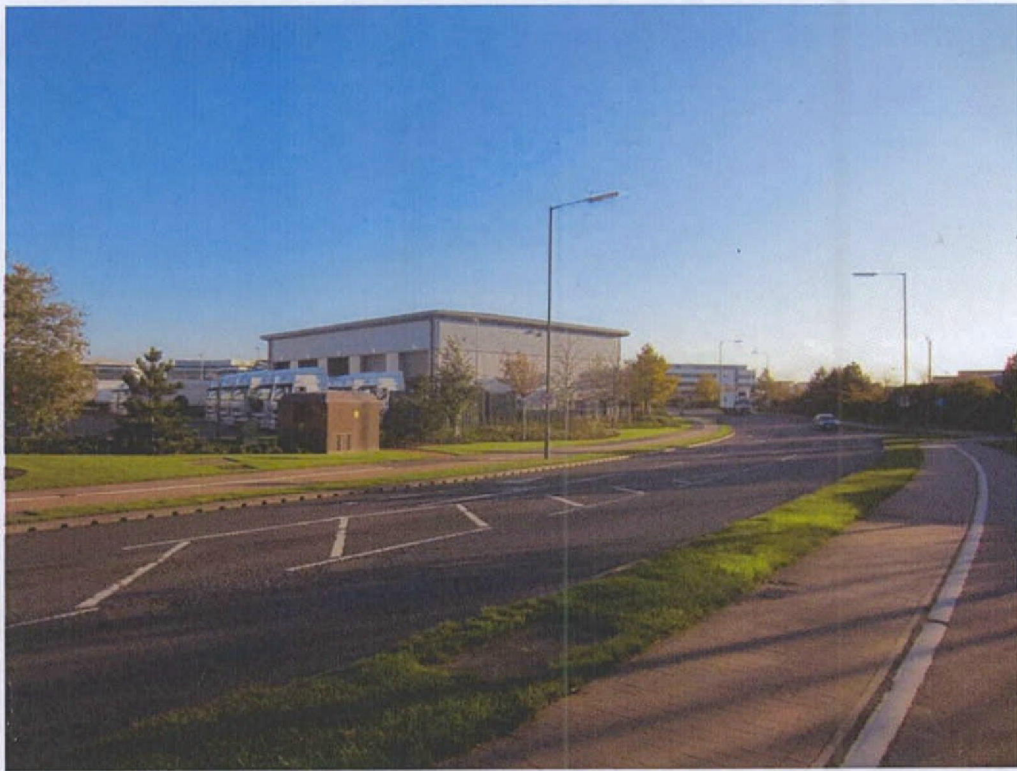
Photo 5: View to the rear of the application site, from Gypsy Moth Avenue