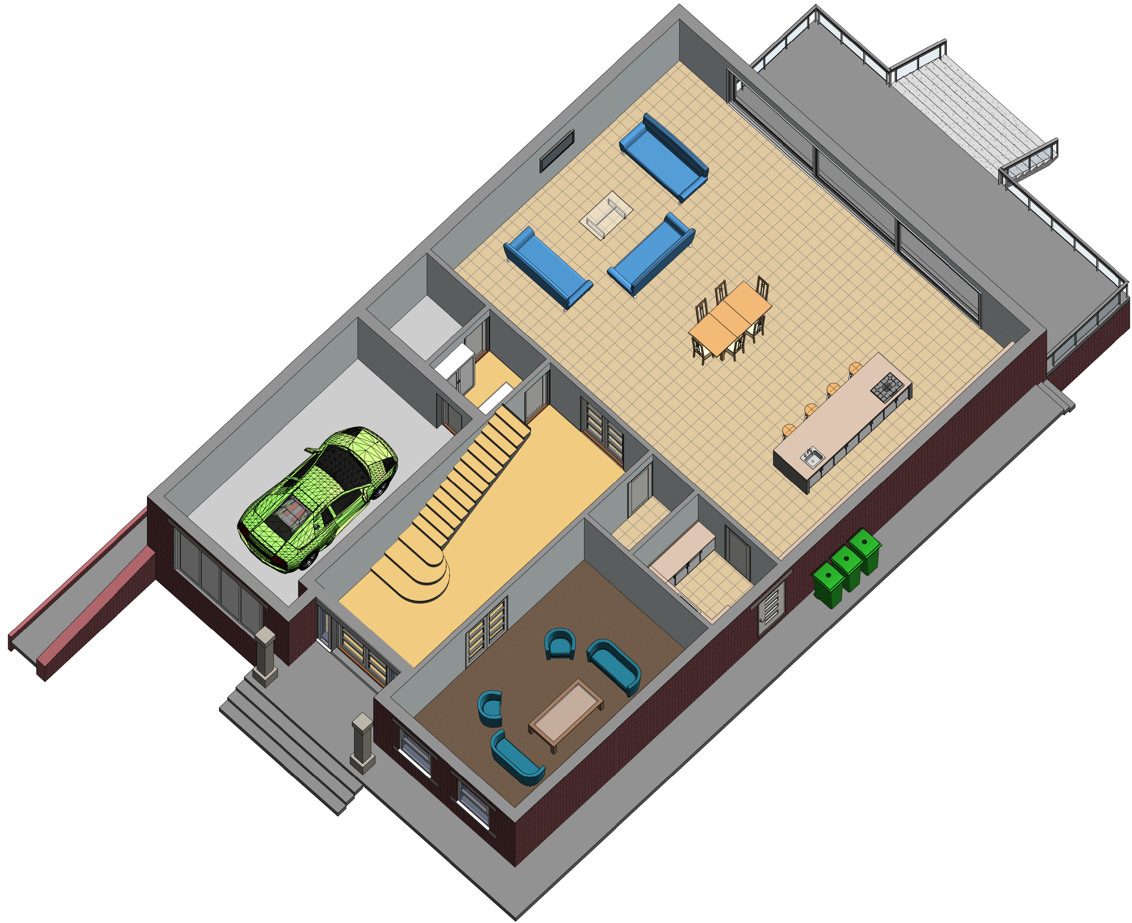
1 Proposed Ground Floor 3D

Contractor to check all dimensions, drain runs and general conditions on site before commencing work. Any discrepancies to be notified to ADL before continuing work. All works to be carried out in accordance with Building Regulations, British Standards, Code of Practice, CDM Regulations and Local Authority requirements. The building owner must obtain formal agreement under the Party Wall Act 1996.