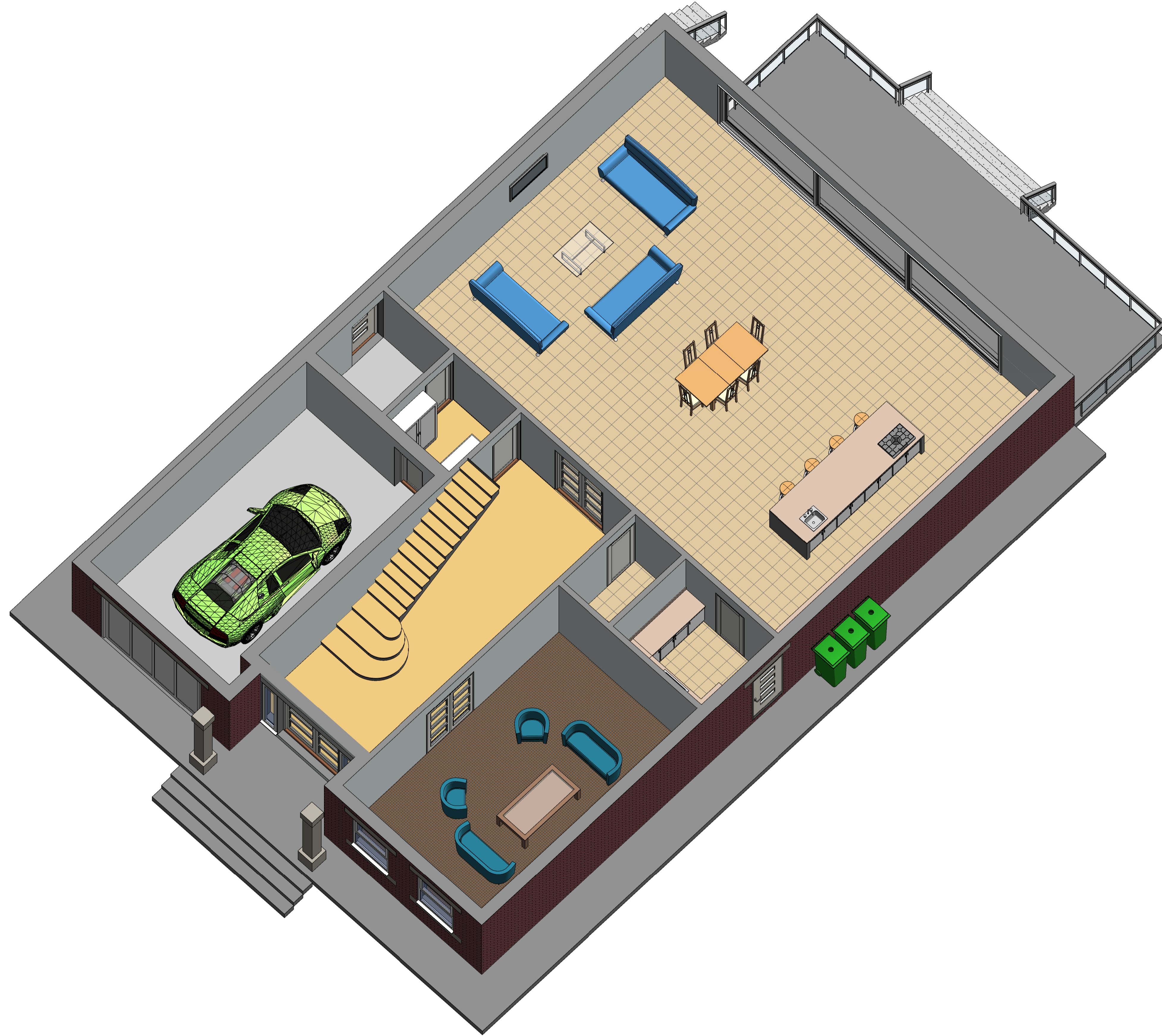
1 Proposed Ground Floor 3D

Contractor to check all dimensions, drain runs and general conditions on site before commencing work. Any discrepancies to be notified to ADI before continuing work. All works to be carried out in accordance with Building Regulations, British Standards, Code of Practice, CDM Regulations and Local Authority requirements. The building owner must obtain formal agreement under the Party Wall Act 1996.